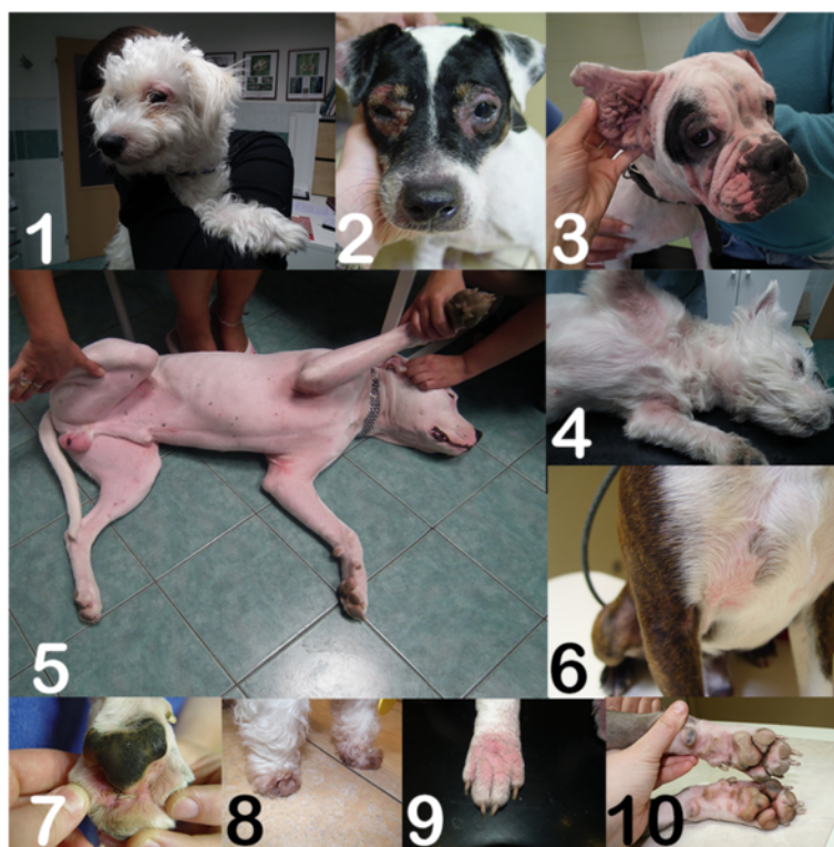
Figure 2 Typical clinical pictures to illustrate canine atopic dermatitis. In 1: Maltese; 2: periocular dermatitis in Jack Russel terrier; 3: English bulldoge; 4: West Highland White terrier (WHW); 5: Doggo Argentino; 6: Boston terrier; Bottom panel: atopic pododermatitis in 7: French bulldoge; 8: WHW; 9: English bulldoge; 10: Pitbull.

diagnosed it may be associated with conjunctivitis in 21% of the dogs [16] and with rhinitis, but it is not associated with asthma [16,17]. The antigen-driven acute and chronic skin inflammation is usually termed CAD by the veterinary dermatologist, is seen independent of a true atopic background in the human sense, but associated with specific IgE [18]. The nomenclature of canine allergic diseases reflects that the skin is the most prominently affected organ: CAD, food induced allergic dermatitis (FIAD), ALD atopic-like dermatitis (ALD), or FAD (Flea Allergy Dermatitis); (asthma and anaphylaxis in dogs are only seen in experimental models, in rare cases anaphylaxis may be drug- or insect venom-induced). Like in humans sensitizations may be associated with an atopic predisposition, which in dogs strongly varies depending on the breed. In a US study 9% of 30.000 investigated dogs showed signs of CAD, among them a series of breeds being at higher risk [19] (Table 1, Figure 3), such as the Labrador [20], Maltese or Shih-Tzu in a Korean study - where in fact sensitizations were mostly found to indoor but not pollen allergens [21]. In a Swiss study, WHWT (White Wine terrier), boxer, French bulldog, Vizsla, bullterrier and Rhodesian ridgeback were at higher risk; additionally, pugs and Dalmatians were over-represented although without significance [22]. Atopic