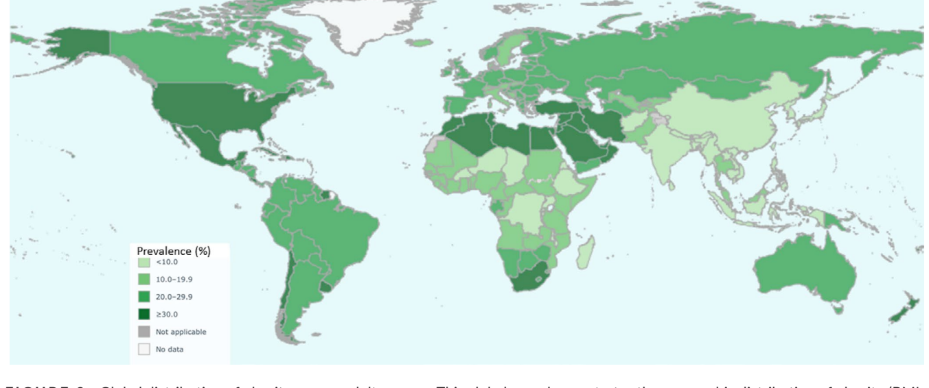
FIGURE 2 Global distribution of obesity among adult women. This global map demonstrates the geographic distribution of obesity (BMI >30) in adult women (>18 y old). The highest prevalence of obesity (>30%) is concentrated within the United States, Mexico, North Africa, South Africa, the Middle East and a few additional countries.

Multiple immune adaptations during pregnancy result in alterations to antiviral immunity. First, syncytiotrophoblast cells that line the placental chorionic villous tree actively secrete type III IFN, which act as an immunologic and physical barrier to viral infection.<sup>93</sup> Systemic immune cellular and cytokine changes during pregnancy can favor either a pro-inflammatory (IL-1, IL-6, IL-12, IFN- \gamma , TNF- \alpha ) or tolerogenic (IL-4, IL-10, IL-13) response depending on the time in gestation.<sup>96-98</sup> SARS-CoV-1 and influenza infections in pregnancy have been associated with an increased pro-inflammatory response