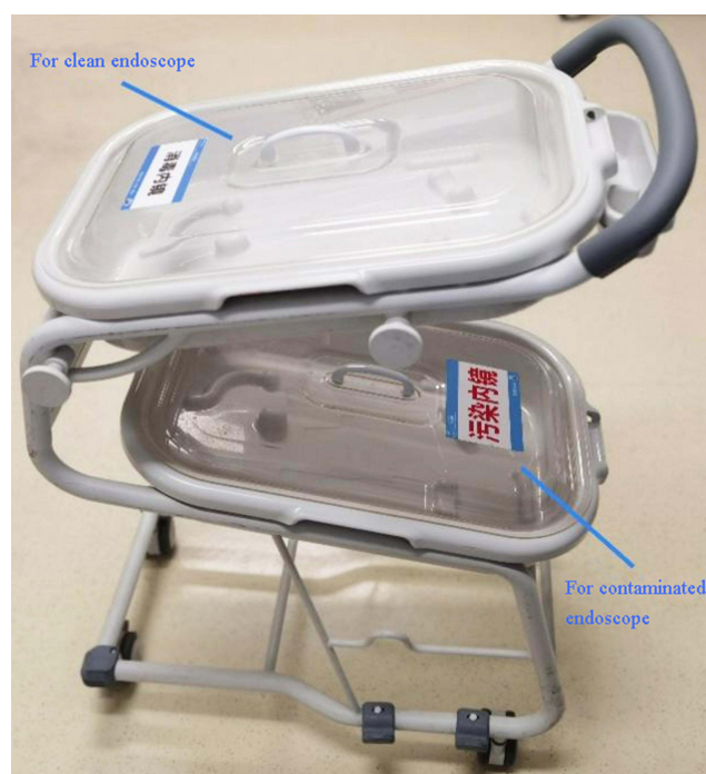
Figure 1 Traditionally used endoscope transport trolley.

group and the experimental group. Of them, 88 were classified into the control group and 87 were classified into the experimental group. The two groups of endoscopes were pre-treated using the same bedside pre-treatment method, according to the requirements of the Regulation for Cleaning and Disinfection Technique of Flexible Endoscope (WS 507–2016) 6 after use. The endoscopes in the control group were delivered to the Digestive Endoscopy Center using the traditionally used transport trolleys (Figure 1) after being put in the disposable transport bags. The endoscopes in the experimental group were transferred to the Digestive Endoscopy Center using the multifunctional transport carts (Figure 2). The multifunctional endoscope transport cart contained a tank for placing the clean endoscopes and a tank for placing the contaminated endoscopes. This separates the clean endoscopes from the contaminated ones. The tank for contaminated endoscopes was configured with medical multi-enzyme detergents for soaking the endoscopes after use. The multifunctional transport cart has the feature of one-touch drainage. After the endoscope soaking procedure was completed, the multi-enzyme detergents in the tank for contaminated endoscopes could be discharged after clicking the drainage button. This met the cleaning and disinfection guidelines' requirements of discarding the multi-enzyme