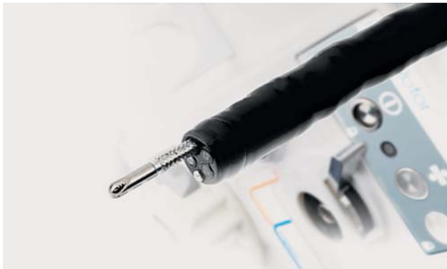
Fig. 1 EndoRotor® catheter (close up) deployed in 3.2-mm colonoscope working channel with electric console unit in background

on tissue, it pulls in the mucosa much more easily than muscle, making mucosal resection with preservation of the muscle layer possible. It allows the user to precisely define the area to be removed and allows for very rapid resection because it resects 2–4 mm of tissue per second with each rotation of the inner cannula (1000–1700 rpm).