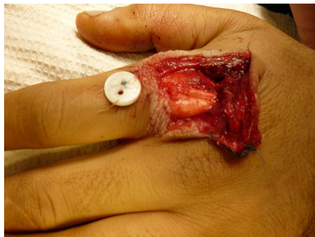
Figure 2. Intraoperative Photography of Roll Stitch Suture