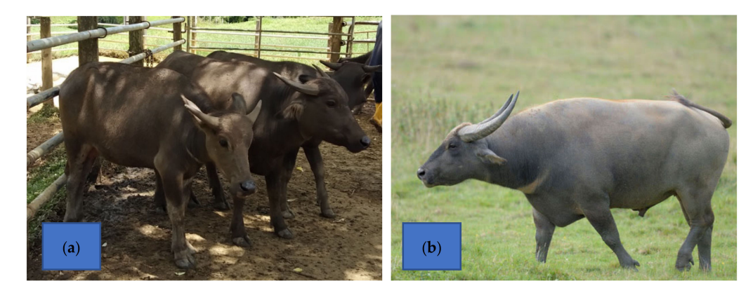
Figure 1. The swamp buffaloes. (a) Calves Swamp buffalo, (b) adult Swamp buffalo. Reprinted with permission from ref. [21]. Copyright 2021 Mohd Azmi et al.

The indigenous breed of buffalo in East and Southeast Asia is the Swamp buffalo ( Bubalus bubalis carabanesis ). It is largely concentrated in Southeast Asia and Southern China (Figure 1). In China, the Swamp buffaloes have adapted to a range of climates, altitudes and temperatures [20]. Therefore, the Swamp buffaloes could be found in both low- and high-lands. Traditionally, the Swamp buffalo is used mainly for draught power, particularly for ploughing paddy fields and transportation, but it is also used to supply meat for human consumption. Until now, some oil palm estates are still using Swamp buffaloes as draught animal to pull carts carrying oil palm bunches. Occasionally, Swamp buffaloes' milk is used to make dairy products such as yoghurt and mozzarella cheese.