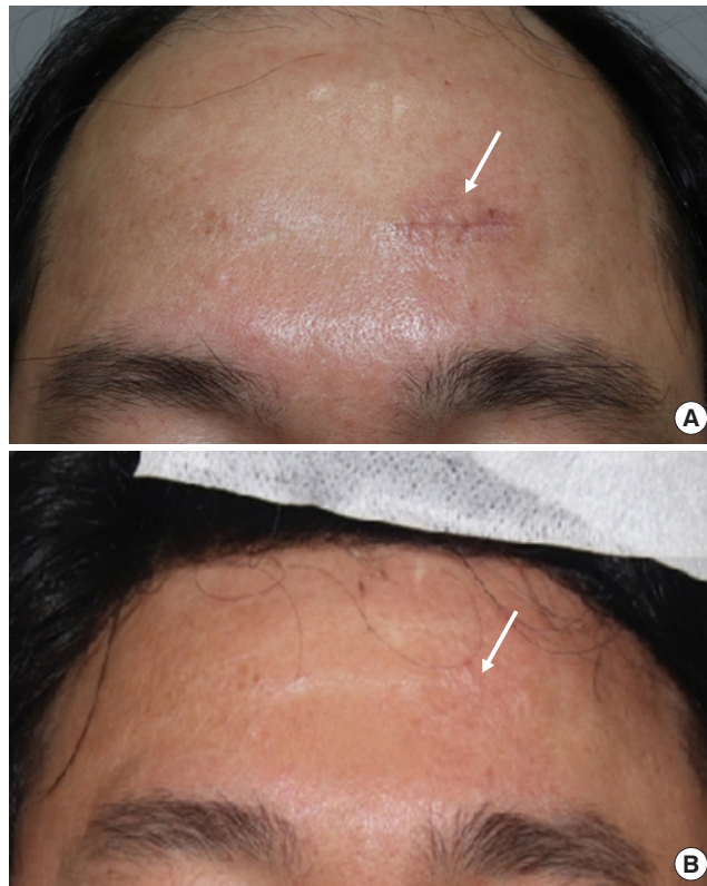
Fig. 4. Postoperative photographs. (A) One-month postoperative photograph showing a 2-cm-long scar (white arrow). (B) Fifteen-month postoperative photograph. The scar (white arrow) had become lighter and no recurrence was observed on the skin.

medium pleomorphic T cells on the dermis, positivity for CD3 and CD4, and negativity for CD8 and CD30 [6-8]. For an accurate diagnosis, it must be differentiated from other lymphoproliferative disorders with similar pathological, histological, and immunostaining results, necessitating a correlation between clinical findings and pathological results. The differential diagnosis includes cutaneous pseudolymphoma, cutaneous B-cell lymphoma, peripheral T-cell lymphoma, and mycosis fungoides [2,4,7,9]. Patients diagnosed with this disease based on a skin biopsy, receive laboratory tests (including a complete blood count and blood chemistry), human T-cell lymphotropic virus testing, TCR gene rearrangement testing, and computed tomography and PET scans [1,2]. The 5-year survival rate is 60% to 80%, and the prognosis is affected by the size of the tumor, the presence of multiple nodules, and differentiation [6,7]. Although there is no specific consensus regarding treatment, previous reports have suggested chemotherapy, radiation therapy,