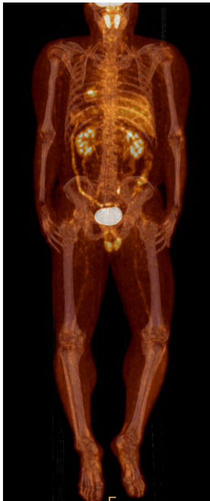
Fig. 3. Positron emission tomography showing no remarkable findings. Physiological muscular uptake in the left ventricle of the heart is present, but not significant uptake.

medium pleomorphic T cells on the dermis, positivity for CD3 and CD4, and negativity for CD8 and CD30 [6-8]. For an accurate diagnosis, it must be differentiated from other lymphoproliferative disorders with similar pathological, histological, and immunostaining results, necessitating a correlation between clinical findings and pathological results. The differential diagnosis includes cutaneous pseudolymphoma, cutaneous B-cell lymphoma, peripheral T-cell lymphoma, and mycosis fungoides [2,4,7,9]. Patients diagnosed with this disease based on a skin biopsy, receive laboratory tests (including a complete blood count and blood chemistry), human T-cell lymphotropic virus testing, TCR gene rearrangement testing, and computed tomography and PET scans [1,2]. The 5-year survival rate is 60% to 80%, and the prognosis is affected by the size of the tumor, the presence of multiple nodules, and differentiation [6,7]. Although there is no specific consensus regarding treatment, previous reports have suggested chemotherapy, radiation therapy,