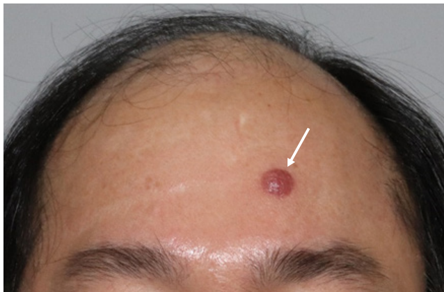
Fig. 1. Preoperative photograph showing an erythematous mass on the forehead (white arrow).

CD20 and CD30; 10%–20% positive for Ki-67; negative for Epstein-Barr virus; and negative for monoclonal B-cell proliferation and clonal T-cell receptor (TCR)-gamma gene rearrangement (Fig. 2). To confirm the above results, additional laboratory and imaging tests were conducted in collaboration with the hematology-oncology department to ensure proper diagnosis