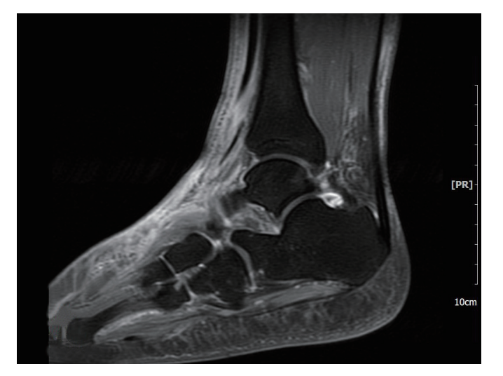
Fig. 1. Magnetic Resonance Imaging: T1-weighted image showing cellulitis associated with talus osteochondral lesions.