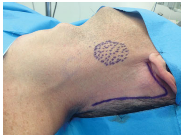
Fig. 1 Retroauricular incision planning.

Patient preparation for surgery was the same as that which is typically used for other neck surgeries performed under general anesthesia. The patient was positioned at the operating table with cervical extension and contralateral head rotation. The surgeon performs the retroauricular incision (→Fig. 1) and raises the subplatysmal skin flap exposing the surgical field limited by neck midline, lower mandible border, omohyoid muscle, and esternocleidomastoid muscle, as described at Yonsei Medical Center Head and Neck Department in Seoul. 15,16,22 During flap elevation, it is important to identify and preserve the great auricular nerve and external jugular vein. Then, a Thompson self-retaining retractor (Thompson Surgical Instruments, Traverse City, U.S.A.) was applied establishing the proper working space. Neck dissection (→Fig. 2), submandibular or neck mass excision was then performed with assistance of an ultrasonic scalpel (Ultra-cision ACE, Johnson & Johnson, U.S.A.), vascular clips (Hem-o-lock, Teleflex, Morrisville, U.S.A.), a 10mm, 30-degree endoscope, and usual laparoscopic instruments (Grasper and Maryland forceps). The surgeon performed any dissections lateral to the carotid artery under direct vision using headlights, albeit without magnification tools, and regular surgical instruments, before introducing the endoscope. Routine dissection and preservation of facial marginal branch, vagus, hypoglossus, lingual, accessory, and phrenic nerves were