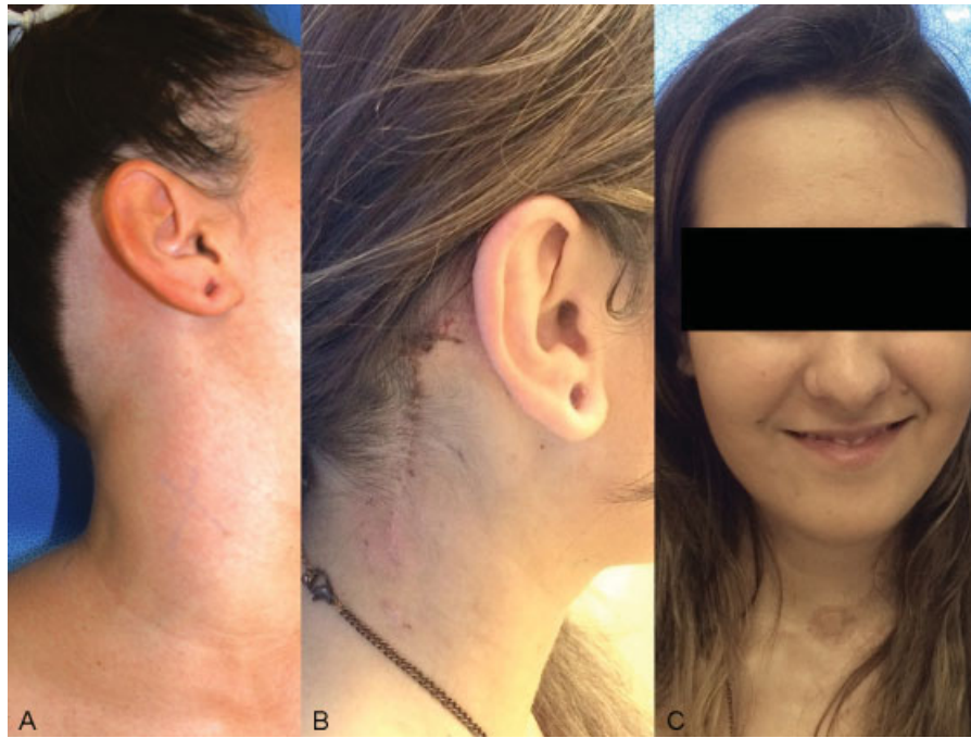
Fig. 3 Retroauricular endoscopy-assisted SOHND combined with hemi-glossectomy and free-flap reconstruction. (A) Preparation; (B,C) Retroauricular scar and cosmetic result in 14th post-operative day.

dissections, thyroid surgery and a wide range of other neck procedures.