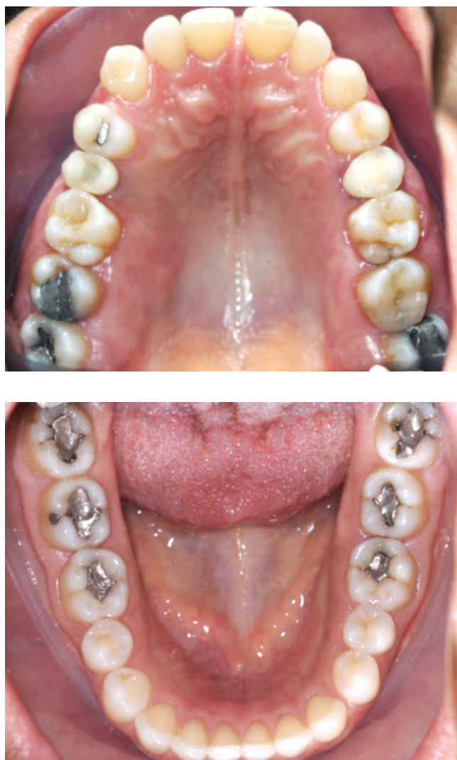
Figure 2 - Same case of florid cemento-osseous dysplasia as in Figure 1, seen for evaluation of possible orthodontic treatment; occlusal view. No clinical signs of disease.

and d) death of osteocytes, cells that have a fundamental role in bone histophysiology.