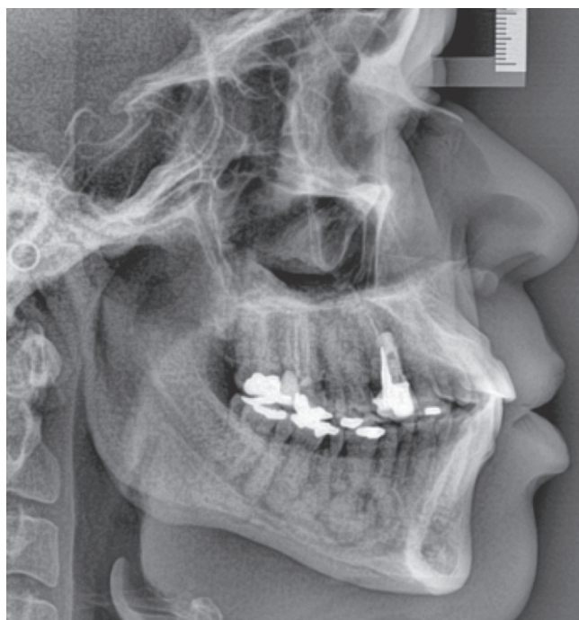
Figure 4 - Other radiographic findings of same clinical case with florid cemento-osseous dysplasia seen for evaluation of possible orthodontic treatment. Mandibular lesions are mixed and overlap roots of molar teeth, as they are randomly distributed in posterior region; cotton-wool appearance.

Surgical procedures of any nature should be avoided, including those for orthodontic treatments, such as traction and the placement of mini-implants and mini-plaques.