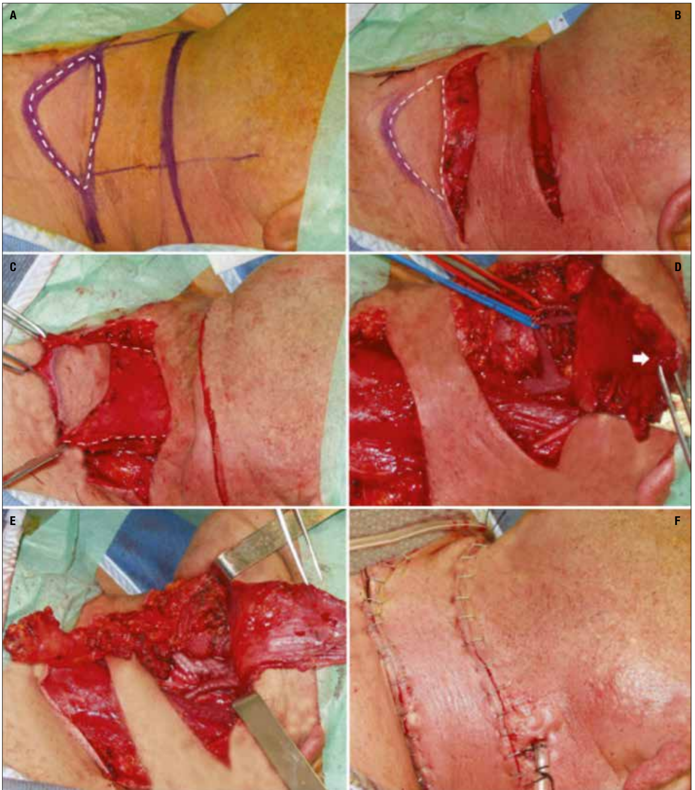
Figure 1. Surgical steps. Panel a: Drawing of the flap. Dotted line: Skin paddle of the platysma myocutaneous flap. Panel b: Cervical incision and identification of the platysma muscle. Dotted line: skin paddle of the platysma myocutaneous flap. Panel c: Harvesting of the platysma myocutaneous flap detaching it from the deep dissection plane. Dotted line: anterior and posterior limit of the incision of the platysma muscle. Panel d: Identification of the facial artery (red vessel loop) and vein (blue vessel loop). White arrow: platysma myocutaneous flap rotated in order to expose the submandibular region. Panel e: Neck dissection of level I is completed by preserving the facial vessels and sacrificing the submental pedicle. Panel f: Closure of the neck incision and the skin donor site.