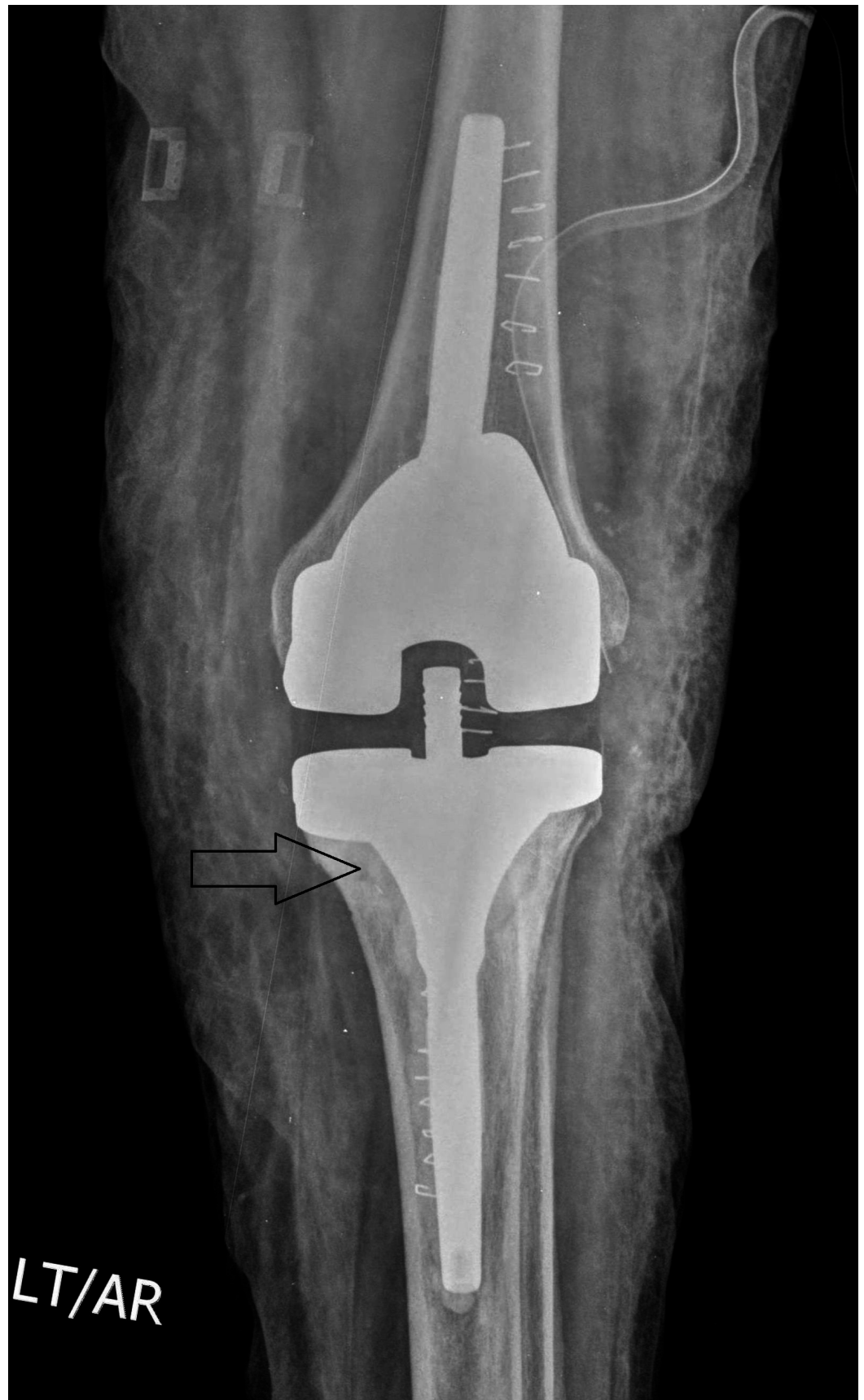
FIGURE 4: Postoperative X-ray (Anteroposterior View) Showing Revision Total Knee Arthroplasty (TKA)