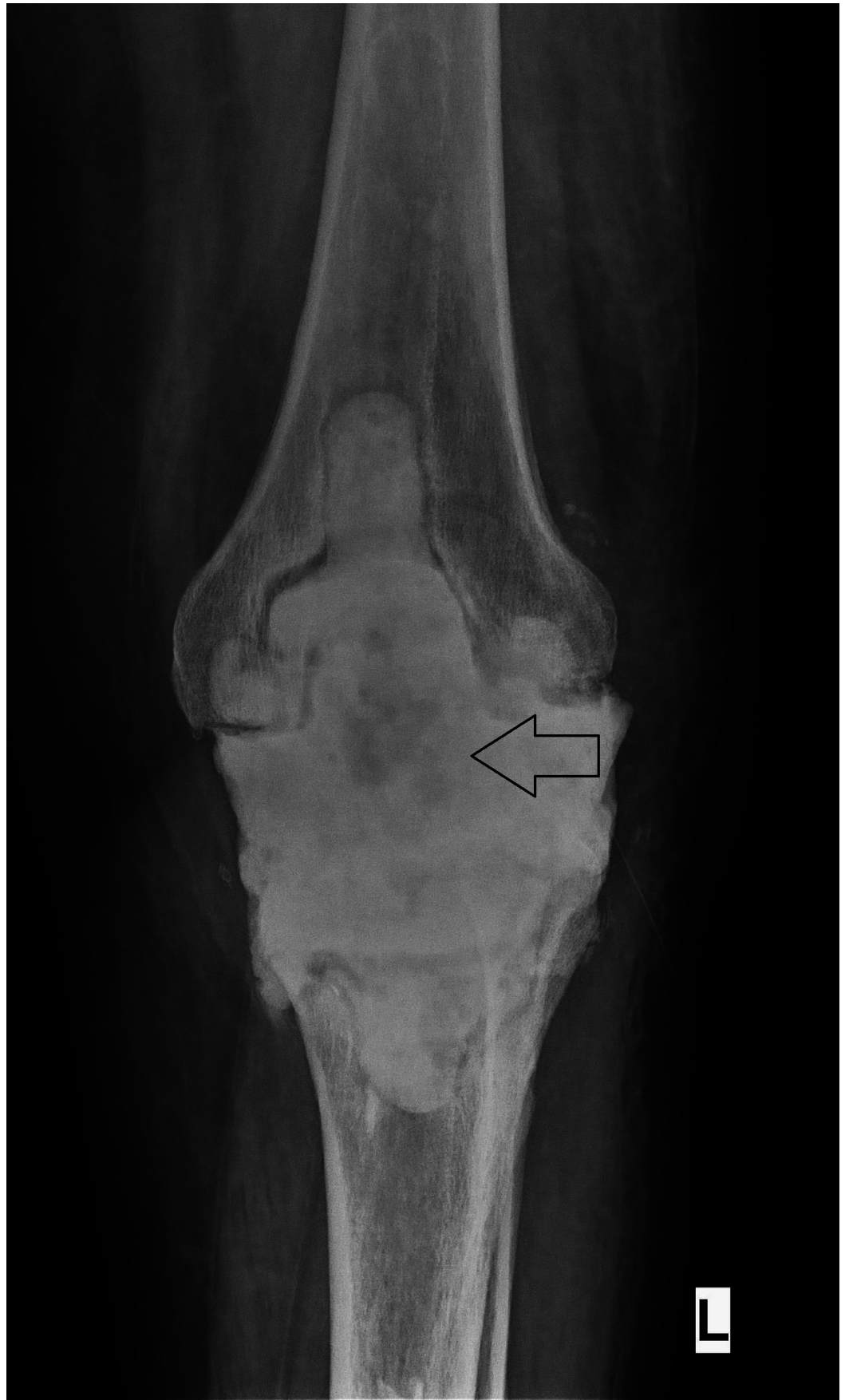
FIGURE 3: X-ray of the Left Knee Showing the Antibiotic-impregnated Bone Cement as Spacer after the Removal of