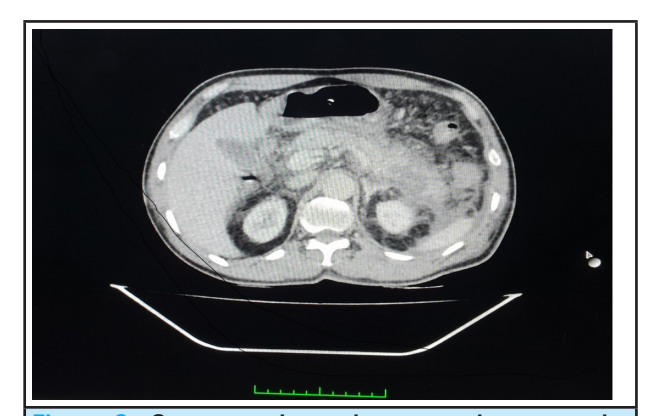
Figure 3. Contrast-enhanced computed tomography of abdomen shows pancreatic necrosis in 30% with swollen neck and tail, peripancreatic inflammation and fluid collection.

A chest x-ray showed bilateral lower zone pneumonia, Ultrasound of the abdomen showed the bulky neck and tail of the pancreas. The plain x-ray of the abdomen was normal. Contrast-enhanced computed tomography (CT) of the abdomen showed pancreatic necrosis in 30% with swollen neckand tail, peripancreatic inflammation, fluid collection and bilateral pleural effusion. The modified CT severity index was 8 (Figure 3).