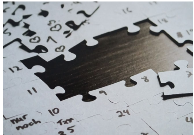
PICTURE 3 NP helps to complete the puzzle [Color figure can be viewed at wileyonlinelibrary.com ]

It is an eh check and..... check the... things as they are there: blood results or whatever,... Currently he is there... does signify not so much. Yes, he is my admission to the immuno. (ID01)