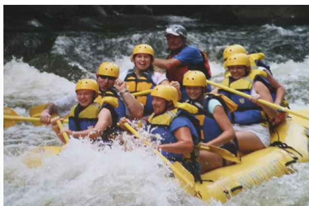
PICTURE 2 Fighting the battle, with the NP in the lead [Color figure can be viewed at wileyonlinelibrary.com ]

the matter.... Yes, a nice talk with the NP and you heard again that it was going well. Yes.... that I was always able to tell her my story.” (ID05)