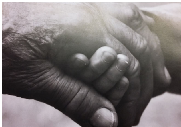
PICTURE 1 Feeling safe, doing it together [Color figure can be viewed at wileyonlinelibrary.com ]

Other, less frequently used, metaphorical expressions were lifebuoy sign and tower of strength . One participant who came up with the latter metaphor described it this way: “I don't have.... no parents anymore. Yes, is logical somehow at this age. Siblings. Yes. Also friends and acquaintances I can talk to. But on the disease level or my body and everything, there she has.... There you talk with... I can talk about it well with her. How I feel. The family situation.... Or whatever else has been a lot of misery. Yes, those kinds of things.... If something was