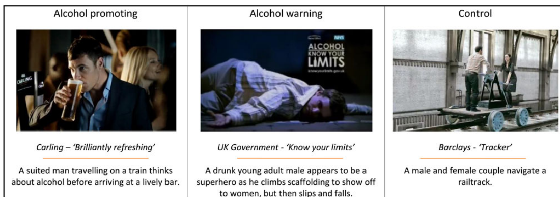
Fig. 1. Example advertisements used in study.

To reduce demand characteristics, questions regarding explicit attitudes were adapted to reflect the control advertisements (banking), e.g. I consider my bank to be: Very pleasant – Very unpleasant . Each of these questions used the same response format as their equivalent alcohol-related question.