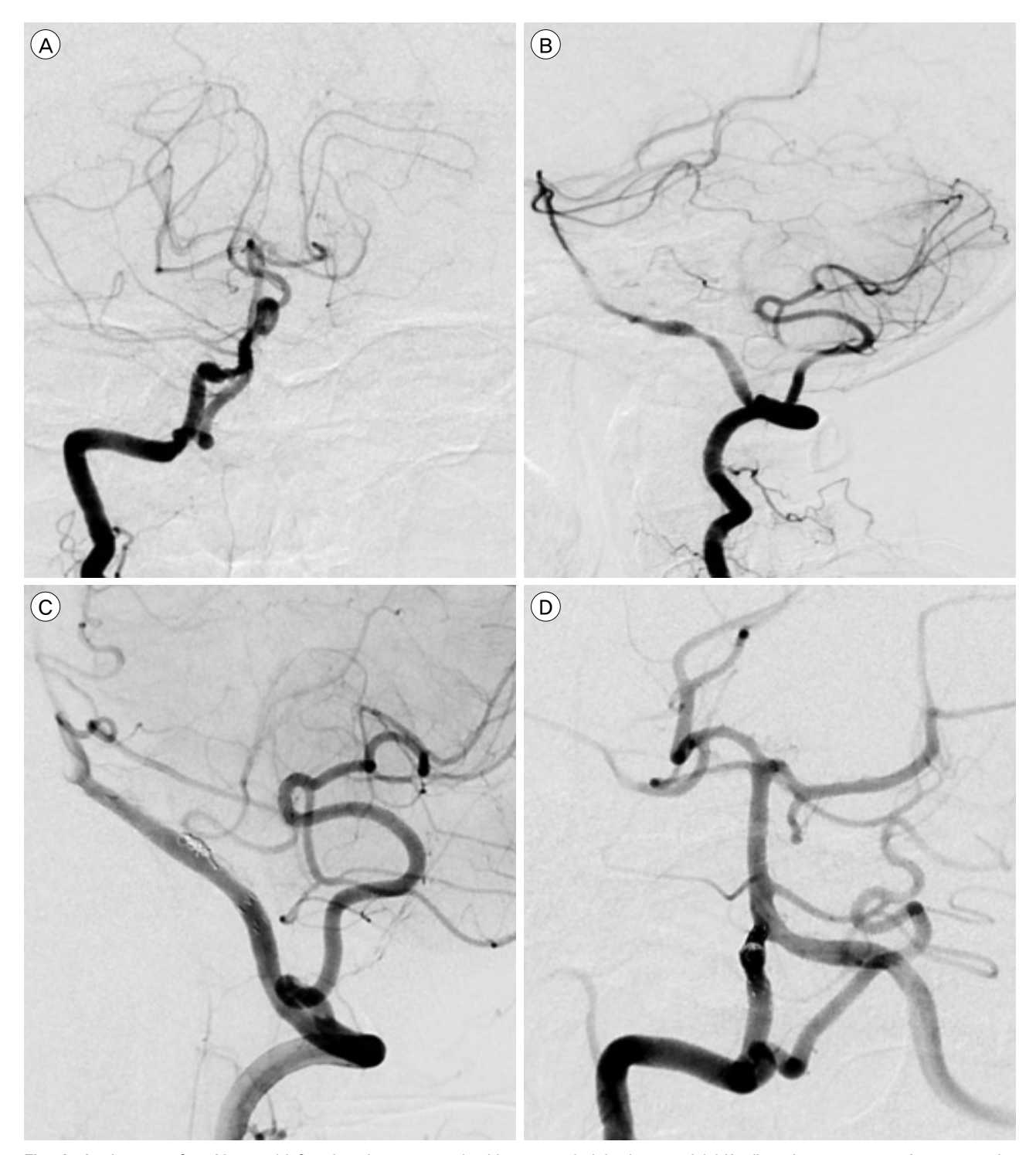
Fig. 1. Angiogram of a 48-year-old female who presented with ruptured right intracranial VA dissecting aneurysm. Anteroposterior (A) and lateral (B) angiograms of the right VA reveal a string sign and fusiform aneurysm formation distal to the PICA. Anteroposterior (C) and lateral (D) angiograms of the VA obtained after telescopic stents and coil embolization demonstrating complete occlusion of the dissecting aneurysm. VA = vertebral artery; PICA = posterior inferior cerebellar artery.

surgery with or without a stent. All patients were treated within 12 hours after onset under general