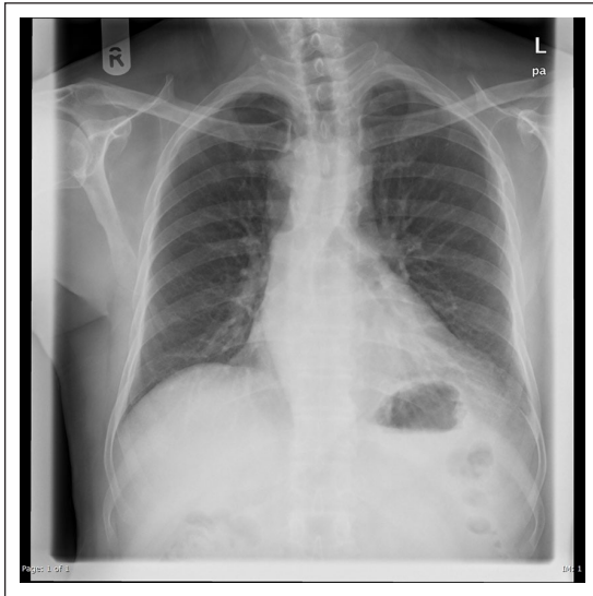
Figure 1. Plain frontal chest X-ray showing widened superior mediastinum and a right-sided descending aorta.

significant left main stem and three vessel coronary artery disease (aortogram not performed; when questioned later, the cardiologist reported no apparent problems with reaching the ascending aorta and cannulating the coronary ostia). He proceeded to coronary artery bypass graft surgery. At operation, the left internal mammary artery (LIMA) was harvested (normal anatomy) and had excellent flow. On opening the pericardium, it was noted that the ascending aorta bifurcated 2 cm below the pericardial reflection with the left branch noted to be half the size of the right branch. There was adequate ascending aorta to cannulate and perform coronary artery bypass grafts (saphenous vein to the right coronary and obtuse marginal arteries and LIMA to left anterior descending artery) in a routine manner. The post-operative course was completely uneventful.