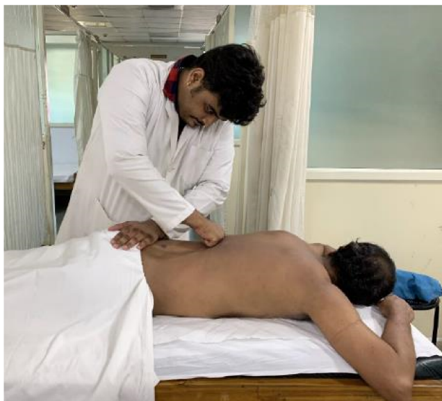
Figure 3 Myofascial release technique.

Full-size DOI: 10.7717/peerj.10706/fig-3