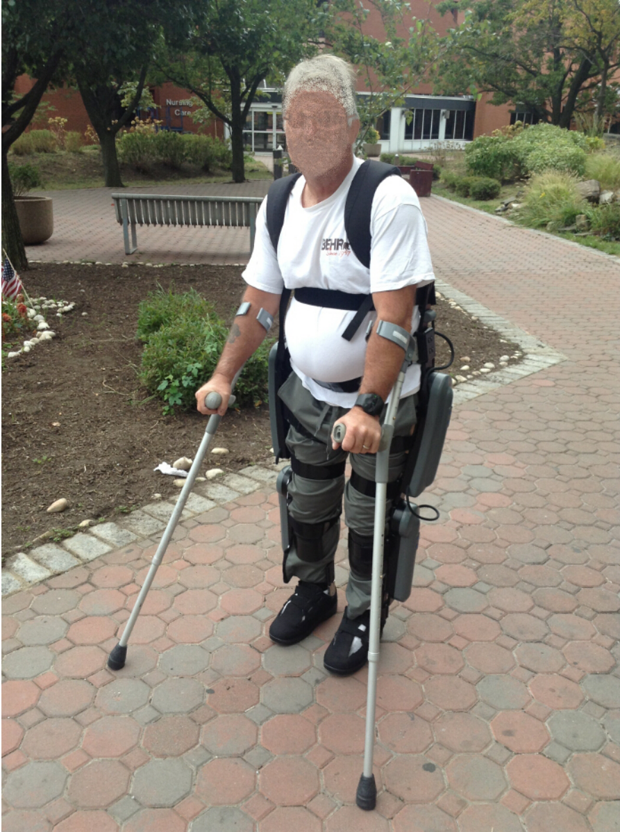
Figure 1. Two handed crutch balance. This figure demonstrates a person standing still and balancing with both crutches. Please click here to view a larger version of this figure.