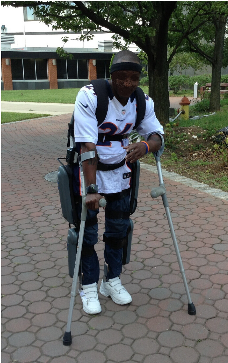
Figure 2. One handed crutch balance. This figure demonstrates a person standing still and balancing with only 1 crutch. Please click here to view a larger version of this figure.