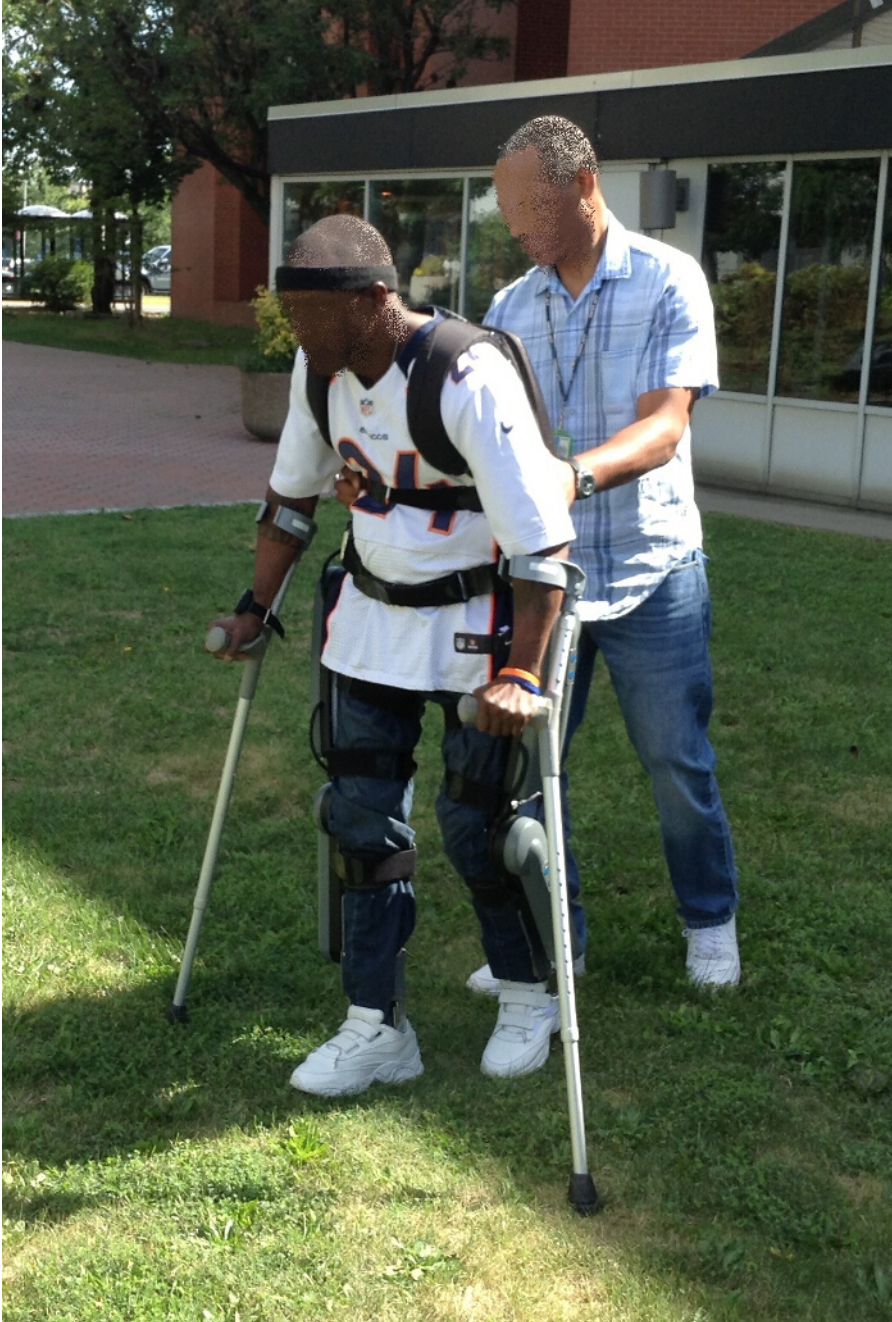
Figure 5. Walking outdoors on grass. This figure demonstrates a person walking outdoors on grass. Please click here to view a larger version of this figure.