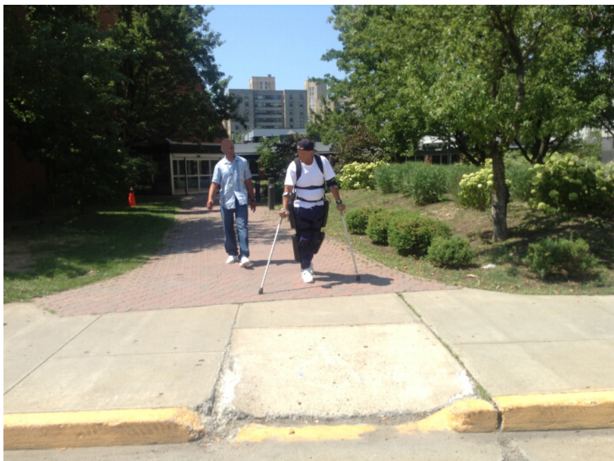
Figure 6. Walking on slopes. This figure demonstrates a person walking outdoors down a curb cutout. Please click here to view a larger version of this figure.