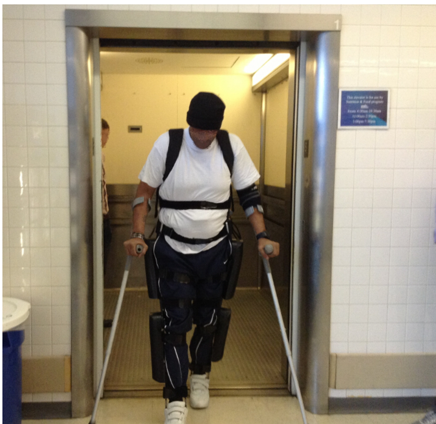
Figure 7. Navigating an elevator. This figure demonstrates a person walking out of a timed door setting such as an elevator door. Please click here to view a larger version of this figure.