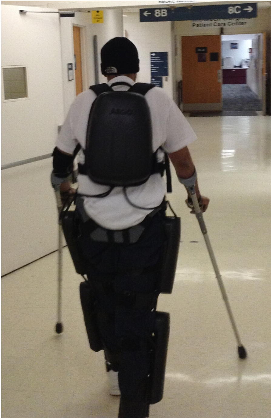
Figure 3. Walking indoors on a smooth surface. This figure demonstrates a person walking indoors on a flat surface. Please click here to view a larger version of this figure.