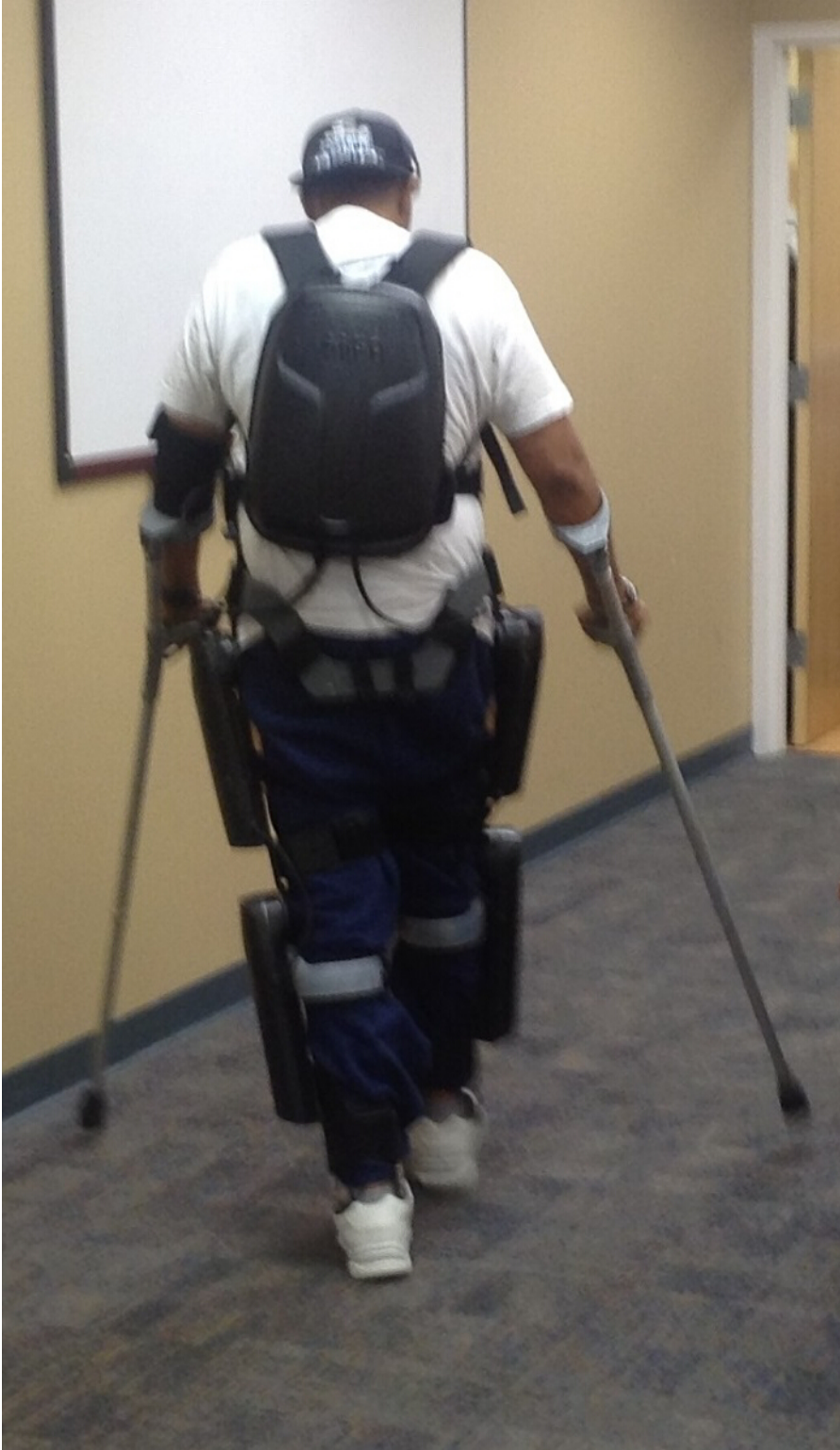
Figure 4. Walking on carpet. This figure demonstrates a person walking indoors on a carpeted surface. Please click here to view a larger version of this figure.