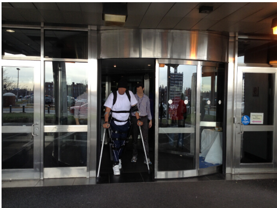
Figure 8. Walking out of a revolving door. This figure demonstrates a person walking out of a revolving door. Please click here to view a larger version of this figure.