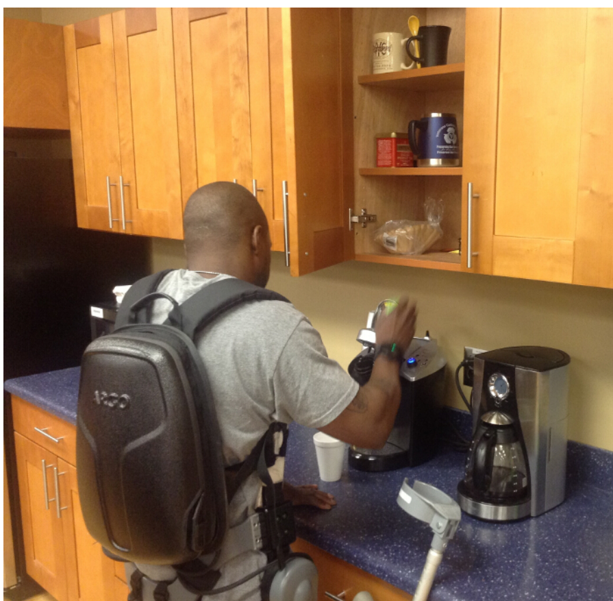
Figure 9. Overhead cabinet and countertop reaching. This figure demonstrates a person taking items out of an overhead cabinet. Please click here to view a larger version of this figure.