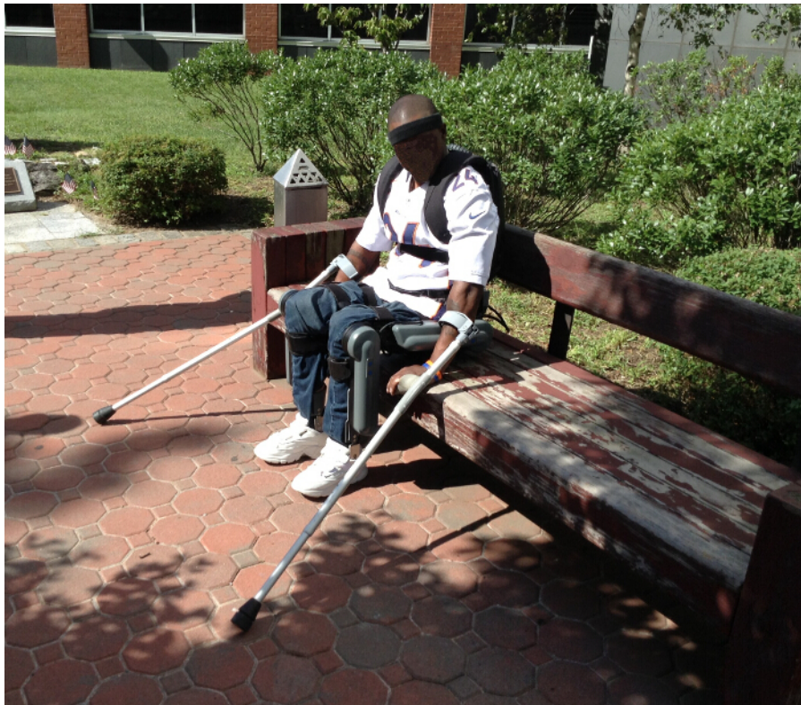
Figure 10. Sitting outside on a park bench. This figure demonstrates a person sitting outside on a park bench. Please click here to view a larger version of this figure.