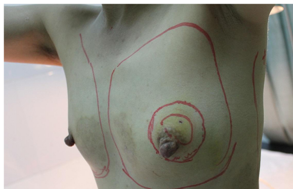
Figure 1 Preoperative photograph of the patient with the breast cancer. The tumor was located in the outer upper quadrant near the nipple (areola) region; the tumor size measured 30 mm × 28 mm in diameter (arrows); the breast size was relatively small (brassiere A cup).

anteriorly abducted, keeping them at an angle less than 90 degrees. Two sandbags were placed on either side of the waist on the contralateral side to stabilize the patient. During the process of harvesting the LDF, the left arm was manipulated in order to expose the operating field clearly. After harvesting the LDF, the patient was returned to the original supine position from the lateral decubitus position without head rotation (Figure 2). The flap was rotated to the chest wall and breast molding and reconstruction with the LDF were carried out. The surgery lasted for four and a half hours, and the entire procedure was performed smoothly, without any surgical injuries to the brachial plexus during axillary dissection. The estimated blood loss was 200 ml and the patient received 2,500 ml of crystalloid and 500 ml of colloid fluid replacement and produced 1,400 ml urine.