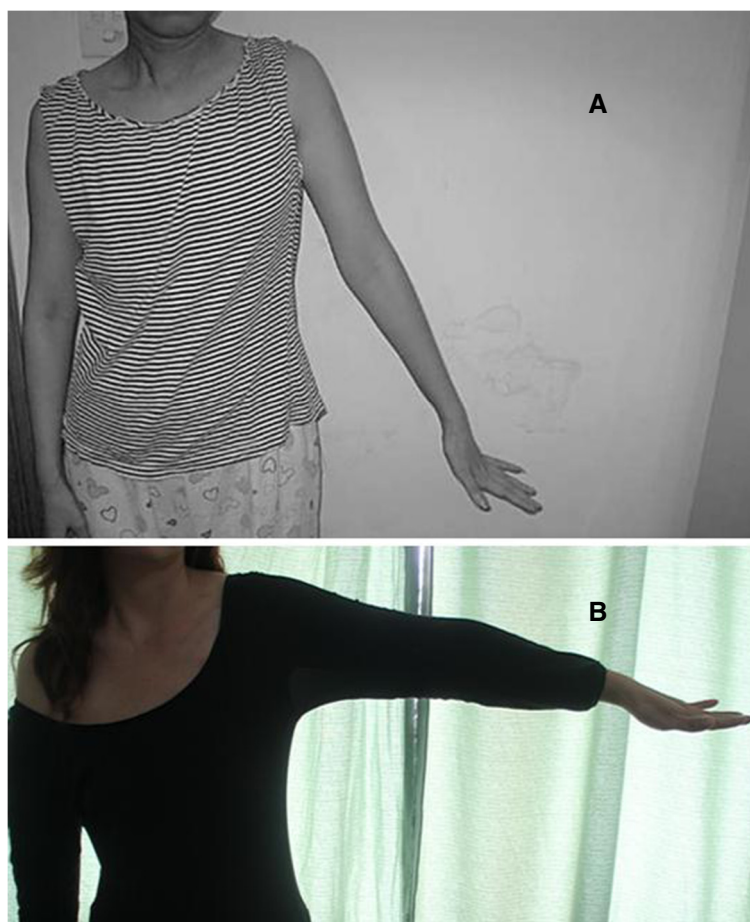
Figure 3 Postoperative photograph of the patient with recovery of the left upper limb. Three months after the surgery, the patient still had weakness of shoulder abduction (only 30 degrees abduction) but flexion and extension of elbow, wrist and fingers were normal (A). Six months after the surgery, the patient's shoulder abduction was 90 degrees, and she fully recovered normal function of her left upper limb (B).

Body weight is also linked to the tension of the brachial plexus when in the respective positions of abduction, extension, or the combination of both [10], and a thinner person is more susceptible to brachial plexus neuropathy for nerve tension appears to be less in the heavier individuals [10]. In our case, the patient was fairly thin and weighed 41 kg which may be a contributing cause of her brachial plexus nerve injury despite reasonable care having been taken while appropriately positioning her. In some certain conditions brachial plexus nerve injury may occur in spite of conventionally accepted positioning and padding [12].