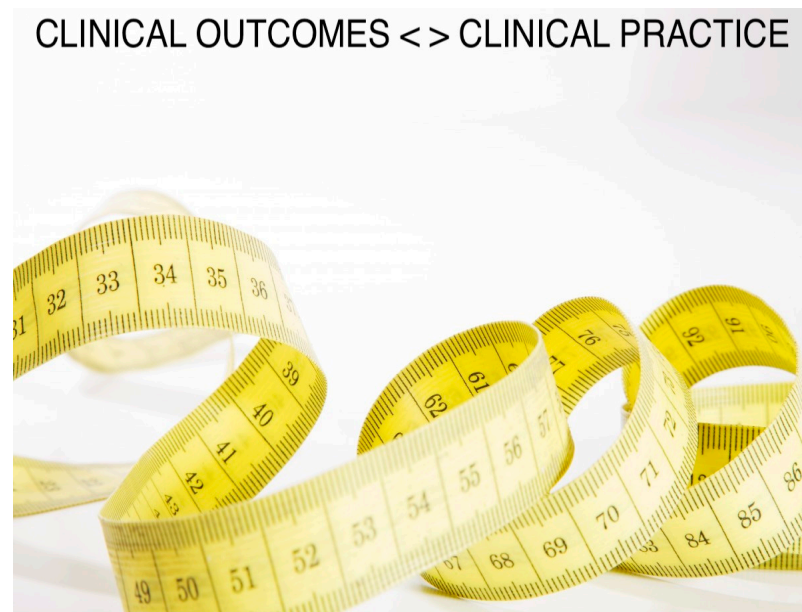
Figure 2. Second photovoice: relationship between ‘clinical outcomes’ and ‘clinical practice’.