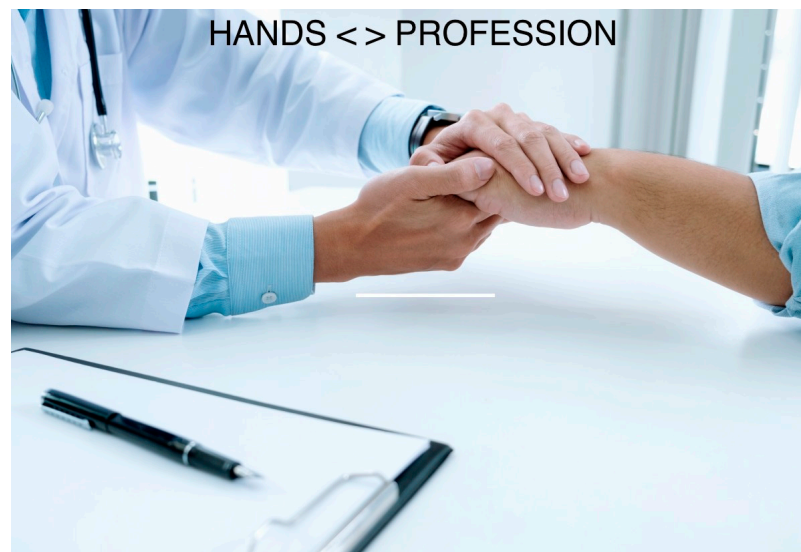
Figure 3. Third photovoice: relationship between ‘hands’ and ‘profession’.

The first VFG was designed of creating open debate and confrontation in a brainstorming atmosphere throughout the use of three photovoices with the aim to create initial disclosure and comfort in interaction with other participants; the second had its target on the use of PFs; the third was focused on the use of SD in the clinical setting; the fourth had the relation between PFs and clinical outcomes as the central topic of discussion.