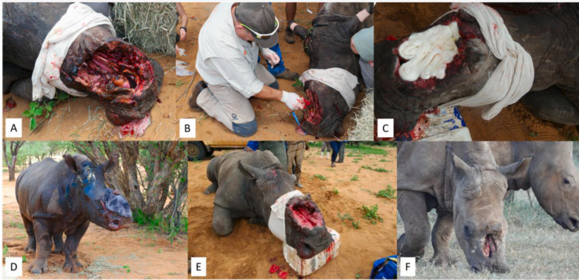
Fig. 6. Gunshot wound through the head and severe damage and loss of tissue following hacking off the horns. A). Wound upon initial presentation. B). Cleaning and treatment of the wound with MGH. C). Application of alginate dressing to cover MGH. D). Elephant skin was placed over the wound to cover it. E). Clear wound progression with abundant areas of granulation tissue following the treatment with MGH. F). Complete healing of the wound after only 6 months.