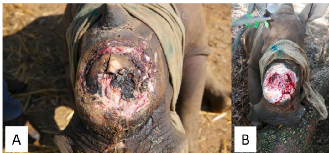
Fig. 5. A broken horn and fractures of the underlying nasal bone, accompanied with signs of infection. A). The wound with visible areas of slough and devitalized tissue at the start of MGH therapy. B). Wound progression after 6 weeks of MGH treatment, with necrotic tissue replaced by healthy granulation tissue.

through three vital operations and almost fully recovered from the wounds (Fig. 7E). Unfortunately, she died of an unrelated bacterial infection of her small intestine after having lived 18 months after her first surgery.