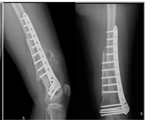
Figure 4: X-rays post-operative shows the reduction and fixation of fracture and bone loss with external metal plate and screws and medial allograft bone strut.