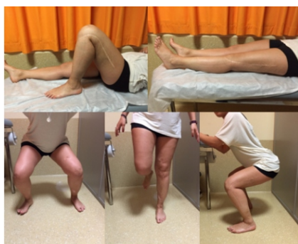
Figure 6: Excellent functional recovery 48 months after injury.

The floating knee is unfortunately always associated with more internal injuries that make it difficult to provide a total care early on [6]. Furthermore, in our case, we had a double IIIB exposure which is very rare in floating knee IIB according to Fraser. Looking at the ISS score and the GCS, we must put a damage control in place [7], before the stabilization of both bone