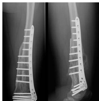
Figure 7: The X-rays shows the perfect consolidation and the femur bone regeneration