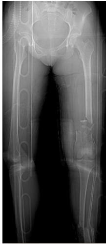
Figure 1: Computed tomography scan shows the floating knee IIB according to Fraser.

bone defect/loss are a challenge for orthopedic surgeons to treat. Bone loss and open fracture are complex injuries that are difficult to manage; despite advances in technique and improved implants, treatment remains a challenge in many situations [5]. The autologous bone reimplant properly treated and the use of bone sticks, derivation of stem cells from the bone marrow and platelet-rich plasma (PRP) is a practice in traumatology used for some years opposed to the metal for the synthesis treats serious bone loss. The purpose of this case report is to report on the proper damage control definitive treatment of bone loss in the treatment of femoral bone loss of a polytrauma affection even