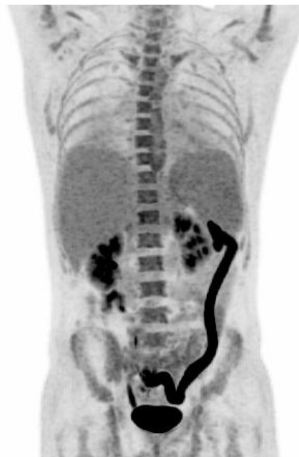
Figure 1. A 33 year-old man with known inflammatory bowel disease (IBD), on azathioprin (Imurel®) and mesalazin (Asacol®) treatment, presented with two weeks of hyperpyrexia up to 40.6 °C, dry cough, and water like diarrhoea which—unlike usual IBD—contained only a limited amount of blood. One month earlier, the patient had been travelling for 17 days in Jamaica. The patient was initially treated as an outpatient with roxithromycin for suspected pneumonia with no effect, and was admitted to the hospital after 10 days with symptoms. At admission, we found elevated C-Reactive Protein (CRP) 58 mg/L (normal range <10 mg/L), Alanine aminotransferase (ALAT) 217 U/L (normal range 10–70 U/L), Lactate dehydrogenase (LDH) 778 U/L (normal range 105–205 U/L), and Ferritin 2,560 µg/L (normal range 12–300 µg/L). Hemoglobin was low 6.5 mmol/L (normal range 8.3–9.5 mmol/L). White blood cell count was within normal range; 6.1 \times 10^9 /L (normal range 3.5\text{--}8.8 \times 10^9 /L). Blood cultures were negative. Human immunodeficiency (HIV) test was negative, hepatitis panels were either negative or consistent with previous vaccination. Dengue IgG and IgM, Zikavirus IgG and IgM and DNA, Chikungunya IgG and IgM and Malaria microscopy were all negative. A stool sample tested negative for bacteria, vira, and parasites. X-ray of the thorax was normal. CT of the abdomen revealed an enlarged descending colon with oedema of the colon mucosa and splenomegaly. The patient did not improve, and due to persistent pyrexia and watery diarrhoea, elevated ALAT and the finding of an enlarged spleen; Epstein Barr virus (EBV) and Cytomegalovirus (CMV) testing were ordered, especially as CMV reactivation have been found to be associated with IBD flare-up in patients on immunosuppressive therapy. EBV serology was consistent with a previous infection; EBV DNA in the blood was negative. Specific CMV IgM antibodies were detected, and CMV IgG antibodies were borderline. However, only 3,000 copies/mL of CMV in the plasma were detected by PCR. At day 10 after admission, an ^{18}\text{F} -FDG PET/CT scan was performed to identify the cause of fever of unknown origin (Figure 1). The scan revealed pathologically high ^{18}\text{F} -FDG uptake in the left side of the colon, and mild diffuse increased activity in the bone marrow and in the enlarged spleen (16.5 cm). The intense ^{18}\text{F} -FDG uptake in the left side of the colon was consistent with either flare-up in IBD or an infectious colitis. CMV testing was repeated on day 8 after admission, and this time both CMV IgG and IgM antibodies were detected, indicating a CMV IgG seroconversion consistent with a primary CMV infection. A sigmoidoscopy revealed inflammation with oedema and submucosal bleeding from 45 to 70 cm from the anus, which is not characteristic for IBD. The biopsy specimen from the colonic lesions did not reveal cells with CMV inclusion bodies, but PCR of the biopsies from the intestinal mucosa were positive for CMV DNA with 12,000 copies/mL suggesting compartmentalization of CMV manifestation. The patient was treated with ganciclovir 5 mg/kg twice daily for 14 days with good clinical