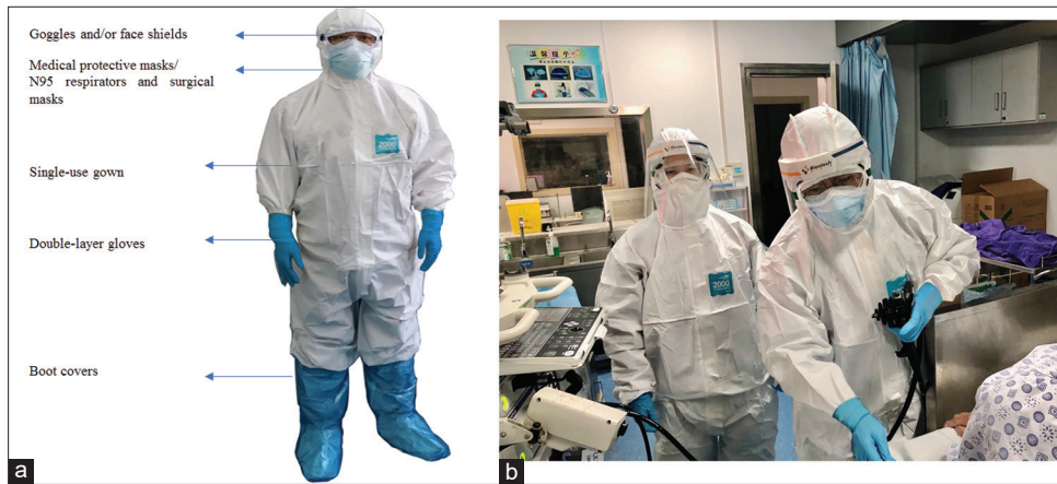
Figure 1. Endoscopy operators' dress code (a) high-risk dressing equipment before entering contamination area; (b) high-risk dressing equipment during EUS procedure