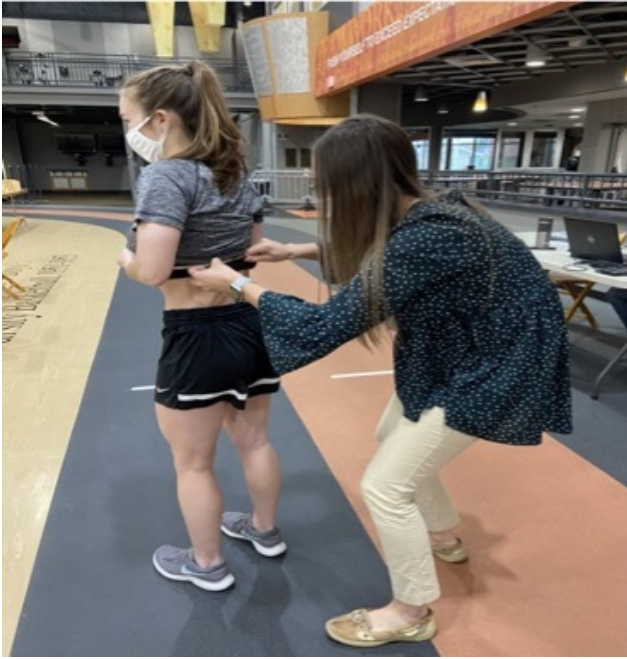
Figure 2. Participant set up.