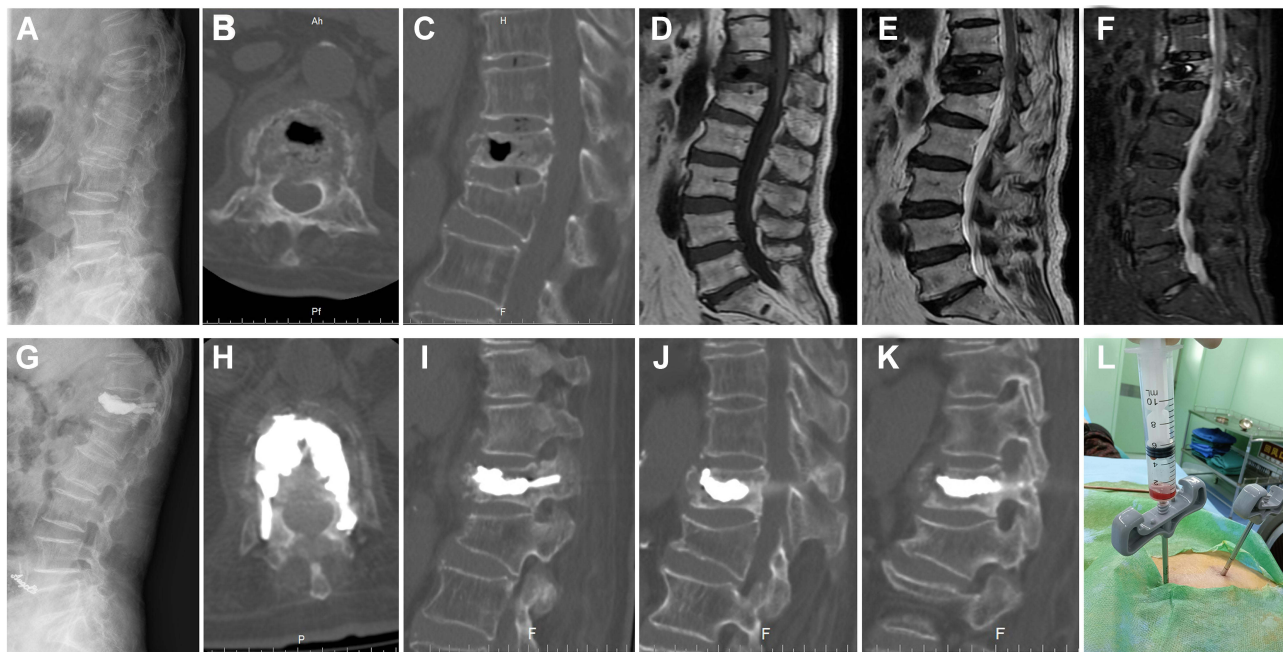
Figure 2 Treatment of Kummell's disease via three-column enhanced PVP. A female aged 85 years complained of "low back pain and discomfort for 2 months". (A) The preoperative lateral X-ray suggested a reduction in the height of the T12 vertebral body. (B and C) Preoperative CT revealed dehiscence of the anterior middle region of vertebra T12 and formation of a vacuum fissure within the vertebra. (D–F) Preoperative MRI confirmed that the T12 vertebral body was a fresh fracture. Also, the vacuum fissure in the vertebral body evidenced a fluid signal. (G) The patient underwent three-column, enhanced PVP. An X-ray taken on the first day after surgery revealed that the bone cement was evenly distributed in the vertebral body and the pedicle. (H) A postoperative plain cross-sectional CT scan showed that the bone cement was evenly distributed in the vertebral body and bilateral pedicle, without leakage into the vertebral canal. (I–K) A postoperative plain sagittal CT scan showed that the bone cement was evenly distributed in the vertebral body and bilateral pedicle. (L) A light-red clear liquid was drawn from the vertebral fissure during the operation.