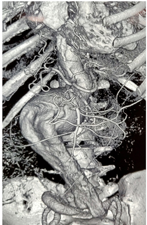
Figure 2. Three-dimensional reconstruction image of abdominal aorta along with bilateral common iliac artery showing large fusiform saccular aneurysm of the abdominal aorta measuring 17.7 cm in length and extending from D12 to L5 vertebral bodies, to the bifurcation, with a neck diameter of 2.5 cm.