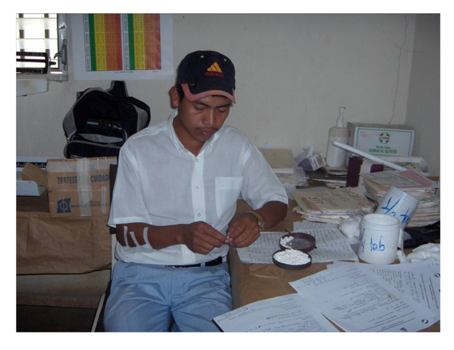
Figure 1. Fractionation of benznidazole tablets. At a health post in Honduras, benznidazole tablets are fractionated by hand into \frac{1}{2} and \frac{1}{4} tablets. Fractionation of tablets is not ideal, as there is a high risk of delivering the improper dosage, thereby raising concerns about safety, efficacy, and decreased stability. doi:10.1371/journal.pntd.0000484.q001

Few rigorous clinical trials have been conducted in CD [24,26,28]. For years, one of the important challenges in drug development for CD has been the evaluation of drug efficacy in the population representing the highest disease burden, patients with chronic indeterminate CD. Such patients do not present any clinical disease manifestation, and serological testing may remain positive for 5 years or even longer after treatment. To date, there are no randomized clinical trials evaluat-