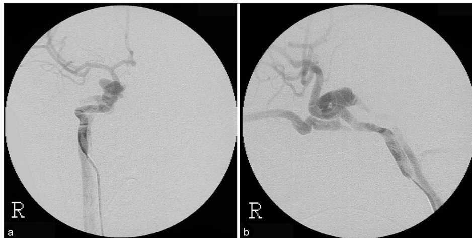
Figure 1: Pre-embolization angiography AP (a) and lateral (b) views showing the fistula at the level of C 4 of the right ICA shunting to the right SOV, right IPS and cavernous sinus

Indeed, there have been few reports of CCF in children. Although the preferred treatment has been endovascular