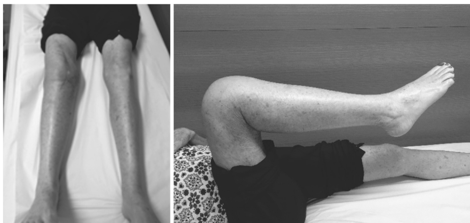
Fig. 4 – Clinical aspect and ROM of the patient with one month after surgery.

usually normal, but degeneration of the joint surface may be present and is more frequent in the hip and shoulder joints. In the knee, these changes are rare, but the narrowing of joint space and osteophytes are findings related to DPVNS, as found in this case. Recent studies suggest that proteolytic enzymes produced by giant cells within the hyperplastic synovial tissue could play a role in this joint degradation. 4 Magnetic resonance imaging is an important test to establish the diagnosis and direct treatment. Areas of low signal on T1 and T2 are observed in the synovial membrane, which is irregular, and the association with joint effusion is frequent. 7