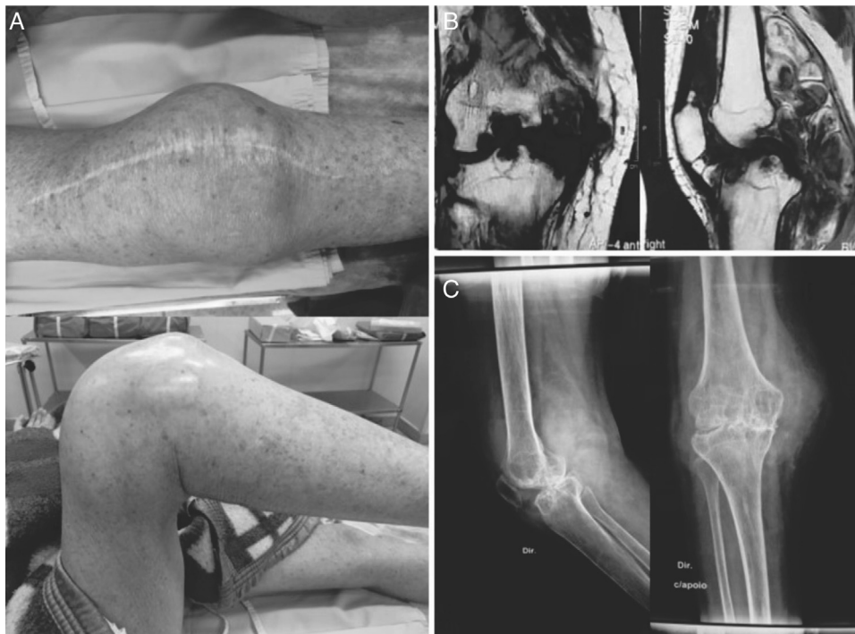
Fig. 1 – Clinical aspect (A), magnetic resonance imaging (B) and radiographs (C), which demonstrate diffuse synovitis, arthrosis, and bone cysts.

A 65-year-old white female patient, who was a housewife and presented with pain, functional restriction, and right knee edema. Diagnosed with diffuse villonodular synovitis for 20 years, she had undergone arthroscopic synovectomy at the time. After a few years, she progressed with relapse of the disease, and eight years ago she underwent a new synovectomy, via open anterior incision surgery, followed by radiotherapy in the postoperative period. After a few years, there was a new relapse of the disease with pain worsening, presence of edema and functional restriction. On physical examination, she had a varus deformity of the right knee, limping gait, bulky joint effusion, diffuse pain on palpation, full extension, though flexion of this knee was restricted to