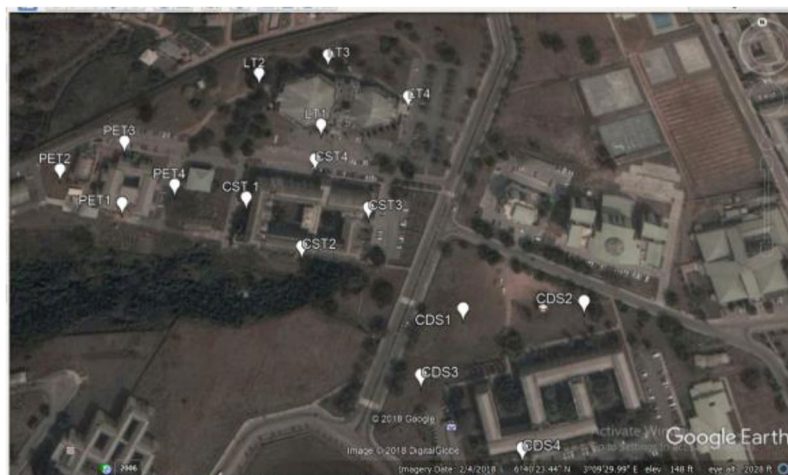
LEGEND CST - College of Science and Technology Environment LT - Lecture Theatre Environment PET - College of Petroleum Engineering Environment CDS - College of Development Studies Environment