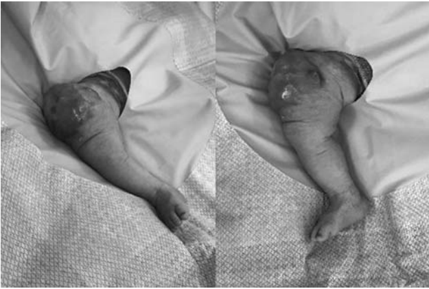
Fig. 1 Appearance of the kaposiform hemangioendothelioma lesion of the anterior right thigh of the patient at excisional biopsy on day of life 3.

delivery due to prenatal concern for a prenatal finding of a dilated vena cava of unknown significance. The baby required routine interventions at delivery. The baby was transferred to the NICU for evaluation. Additionally, his initial exam found a large vascular tumor on the anterior right thigh (► Fig. 1 ), but was otherwise normal.