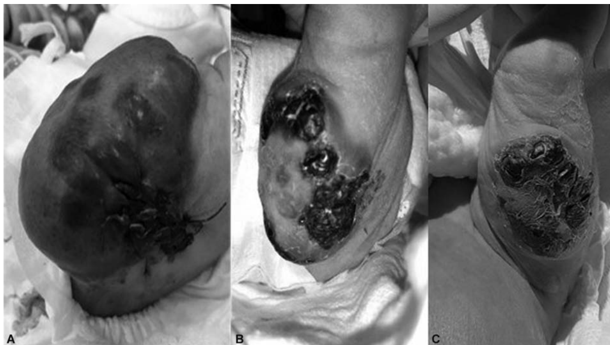
Fig. 2 Progression of the kaposiform hemangioendothelioma lesion during inpatient treatment: (A) postoperative day 1; (B) after 4 weeks of treatment; (C) after 5 weeks of treatment.