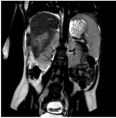
Figure 1. Non-contrast magnetic resonance imaging of abdomen and pelvis: heterogeneous mass 11.2×7.7 cm arising from right kidney extending to liver edge, splenomegaly with spleen measuring 15.2 cm and mild right hydronephrosis.

prior to presentation. Actinomyces has been associated with appendicitis in case reports and may have been the initial source of peri-nephric infection. 10-12 Splenomegaly, which was present in our case, and actinomycotic infection has been associated with splenic rupture. 13 Dental caries may be a possible source of spread to perinephric structures, 14 however our patient had no known dental disease.