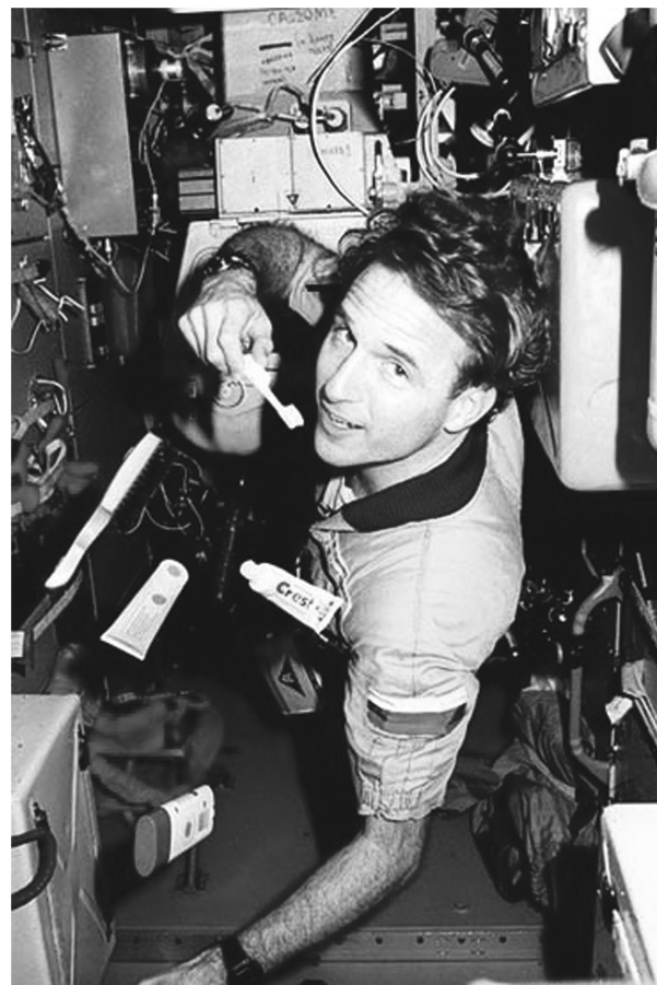
Figure 1. Astronaut Jerry Linenger with personal hygiene items onboard the Russian Space Station MIR.

a Saturated vapor concentration = (VP/760) \times 10^6 .