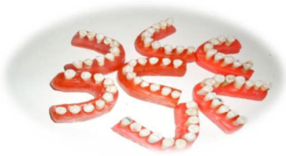
Figure 1. Teeth were mounted in rose wax casts in dental arch form

relationship between the crown size and the prevalence of two root canals in mandibular incisors by Peck & Peck index of orthodontics. This index describes the numerical expression of the crown shape and is the result of dividing maximum mesiodistal (MD) diameter by maximum faciolingual (FL) diameter multiplied by 100. Using caliper, they calculated Peck & Peck index for teeth determined as two-canal incisors in radiography, and evaluated the relationship between the teeth with two canals and the index [6].