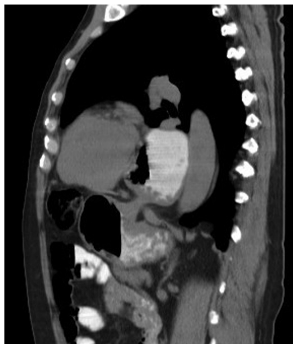
Fig. 1. Thoraco-abdomino-pelvic CT scan showing a volumous paraesophageal gastric herniation.