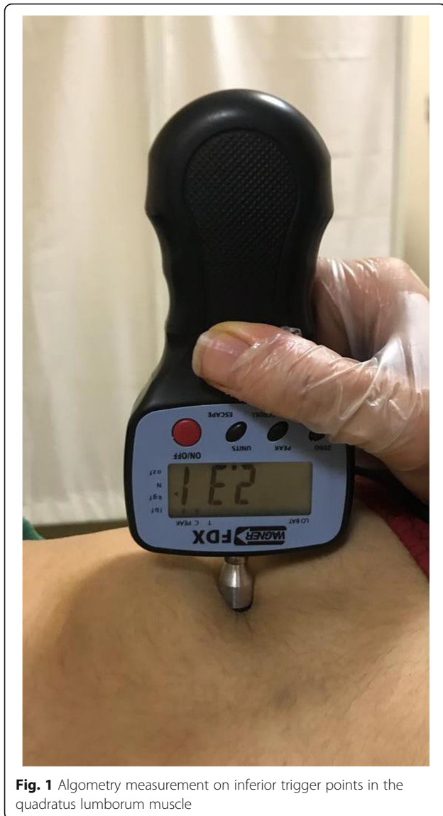
Fig. 1 Algometry measurement on inferior trigger points in the quadratus lumborum muscle