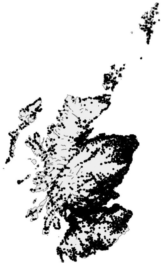
FIG. 1. Map displaying the distribution of population centroids throughout the whole of Scotland (i.e., geographical centers of population).

From 1979 until 1982, a radioimmunoassay (RIA) from Corning Diagnostics Ltd. (Sudbury, United Kingdom) was employed to determine blood spot TSH concentration. This was replaced by an in-house RIA (1982–1989), which was superseded by an immunoradiometric assay manufactured by IDS (Baldon, United Kingdom) from 1989 until 2002. Respective negative, repeat testing limits, and immediate referral concentrations of TSH for these assays were: <25 , 25–49, \geq 50 mU/L; <15 , 15–39, \geq 40 mU/L; and <10 , 10–39, \geq 40 mU/L