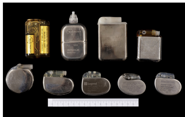
Figure 2 Examples of the pacemakers the patient received. From left to right, top to bottom: Teletronics P6 (1969), Teletronics P10 (1972 & 1974), Teletronics 120B (1976), Intermedics 223-01 (1980), Medtronic Mirel VL (1980), Medtronic Activatrax VVI+ (1986), Medtronic Legend 8416 (1995), St Jude Verity ADX 5156 (2008), Medtronic Azure SR (2021).

We believe this patient with 53 years of pacing to be the longest reported example of cardiac pacing. While cardiac pacing is now regarded as routine with advancements in battery chemistry and software and hardware technology, this was not the case in the early days of cardiac pacing. The first fully implanted pacemaker in 1958 failed after 8 hours. 1 Pacemakers were initially implanted with epicardial leads, requiring thoracotomy, and these patients typically had