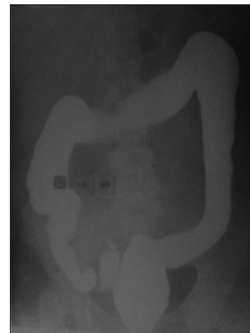
Figure 3: Barium enema of case 2

between 1 st January 1995 and 21 st May 2006. [7,8] Apart from the compounding problems of absence of population based health surveys and adequate medical recording system, the perception that UC is a disease of the Caucasian population points to condition that is potentially under-diagnosed.