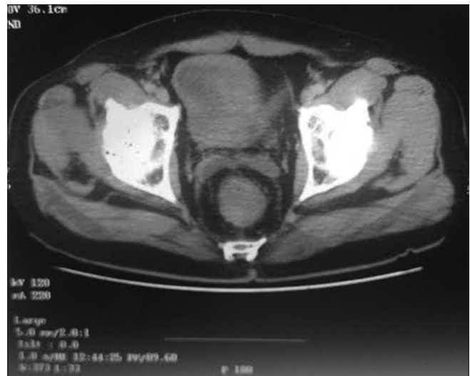
Figure 1: Computed tomography scan image showing thickened rectal wall

Ulcerative colitis is reportedly very rare in black Africans compared to Western populations. [6] The appreciable data from the disease is mainly from South Africa. This could be attributed to the better health system infrastructure in that country juxtaposed with other sub-Saharan African countries. There are no large patient series from Nigeria despite its population of about 160 million. This becomes more worrisome when neighbouring smaller countries seem to have comparatively larger reported cases. A report from Senegal revealed 32 cases of UC over a 7 years period while from Burkina Faso, Bougouma published 20 cases seen