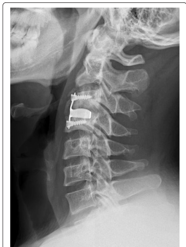
Fig. 3 Lateral radiograph showing C3 and C4 screw loosening and heterotopic ossification formed 5 months after the operation