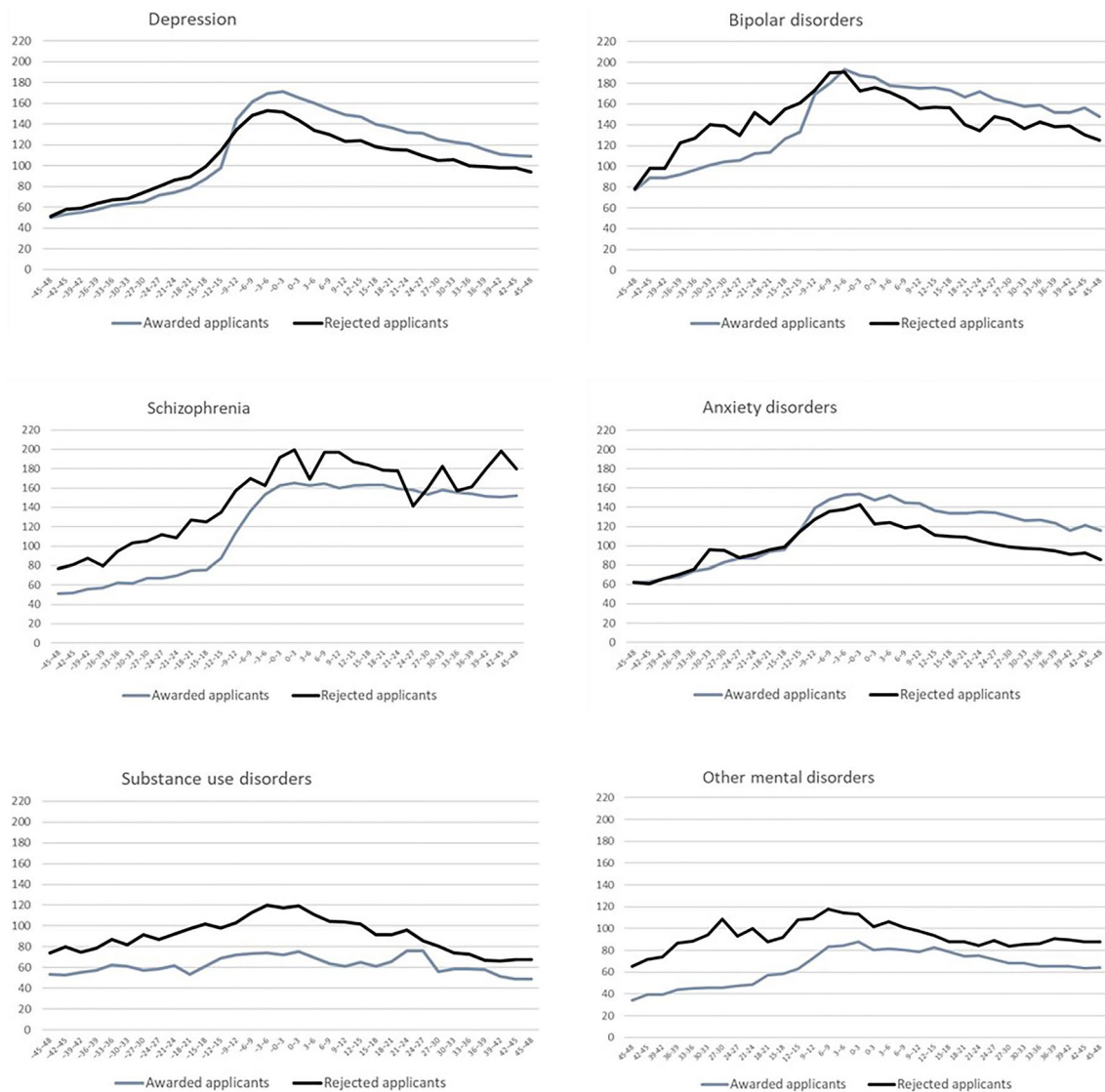
Fig. 2 Purchases of psychotropic drugs (defined daily doses, DDD) in 3-month periods before and after applying for disability pension by application outcome and diagnostic group

the decision. The difference was, however, not statistically significant in these three diagnostic groups.