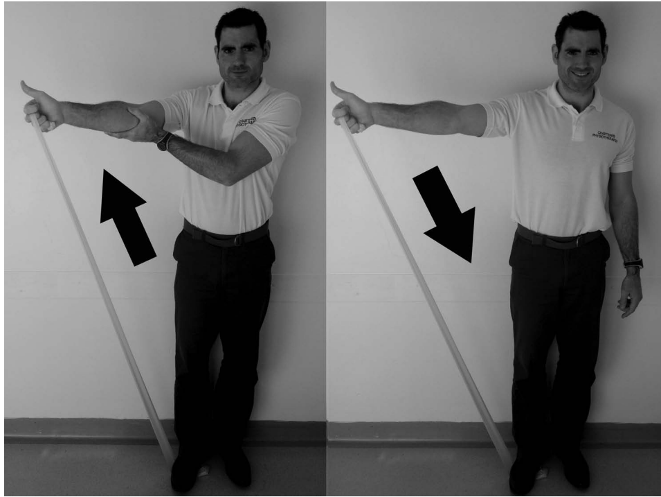
Figure 2. A demonstration of the eccentric exercise technique.

Patients were invited to telephone the lead researcher (M.B.) if they experienced any problems although none actually did. Patients in exercise groups had a review appointment with the lead researcher (M.B.) in the Physiotherapy Clinic 4 weeks after commencing the trial. It was felt that reviewing patients in the clinic more frequently than once every 4 weeks might have a negative effect on compliance if they had to arrange appointments around work or had to travel a long distance. At the 4-week appointment, the amount of resistance used for the exercise groups was increased as a treatment progression provided there had been no deterioration in symptoms. This was done by giving the patient the next grade of resistance of elastic exercise band (coloured red).