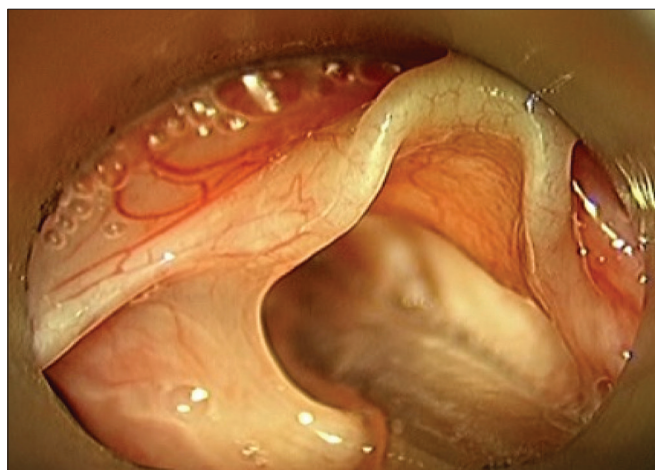
Figure 1. Intraoperative aspect of a 3 - month old child with laryngomalacia, detail of the aryepiglottic fold shortening.

The time of surgery ranged from 1 to 12 months of age. All patients underwent suspension microlaryngoscopy, and supraglottoplasty was performed under general anesthesia and tracheal intubation (Figures 1 and 2 of case number 3).