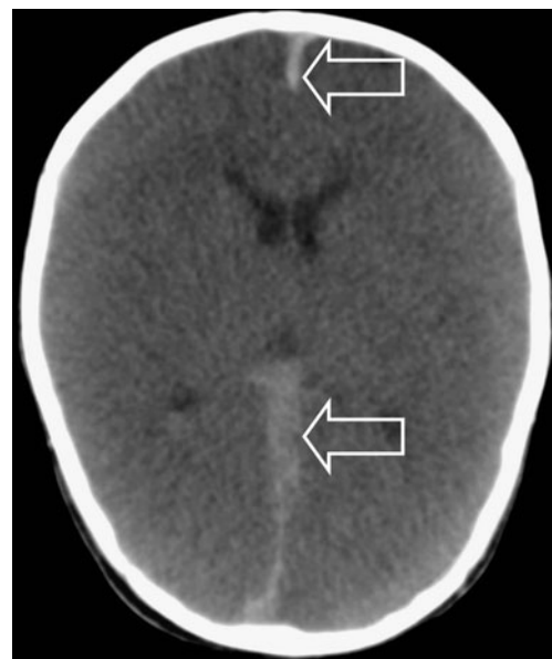
Fig. 1 Two-month-old boy, victim of abusive head trauma. The CT shows an interhemispheric subdural haematoma along the falx cerebri. Subdural haematomas in children often extend along the falx cerebri and this should not be confused with calcification, which is seen at an older age

In a recent systematic review on ocular signs in AHT intraocular haemorrhages were seen in 74% (range 51%–100%) of 560 combined cases of AHT and in 82% (range 63–100%) of cases in autopsy series [3]. Retinal haemorrhages are bilateral in 85% of AHT cases [27]. Injuries