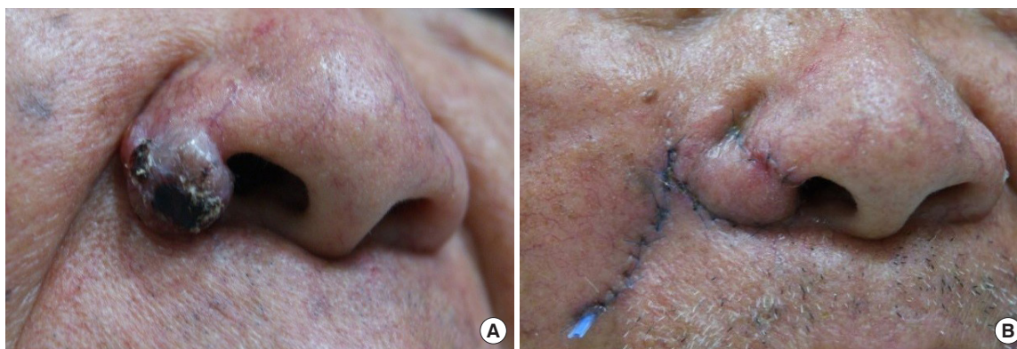
Fig. 2. An 84-year-old man was diagnosed with basal cell carcinoma in the nasal ala, and the defect was reconstructed with a nasolabial transposition flap after a wide excision. (A) Preoperative photograph. (B) Immediate postoperative photograph. His visual analog scale score was 7.