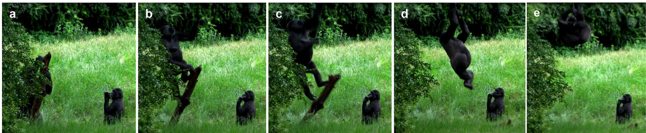
Fig. 2 Behavioural sequence associated with Observation 4. The adult female named Gyasi (on the left) a erected a wooden log under the oak branch while firmly grabbing it with both hands, b climbed

onto it while looking at the branch, c jumped toward the branch, d grabbed it with both hands, and e climbed onto the oak tree to get access to fresh leaves