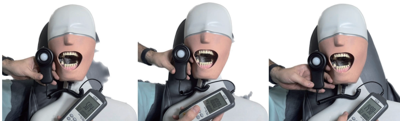
Fig. 1. Lux measurements of lighting environments.