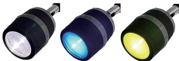
Fig. 2. Color filters: White (7500 K), Blue (19000 K), and Yellow (3900 K).

ferent color temperatures were obtained by adding a conversion filter to the tip of a portable reflector, resulting in desired colors: white (7500 K), blue (19000 K), and yellow (3900 K) (Fig. 2). Thus, a total of 12 possible lighting conditions were created. All environments were created in a windowless, naturally lit (NL), and dark room.