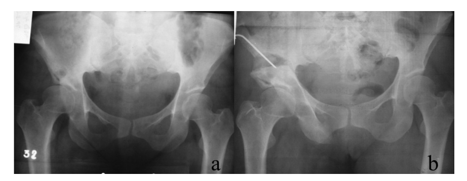
Fig. 1. Anteroposterior pelvic radiographs of a female with unilateral residual hip dysplasia. a) Preoperative and b) early postoperative radiographs. The patient was 47 years old at the time of the operation. After operation, both the lateral centre-edge (from 20° to 40°) and acetabular angles (from 38° to 22°) have improved significantly.