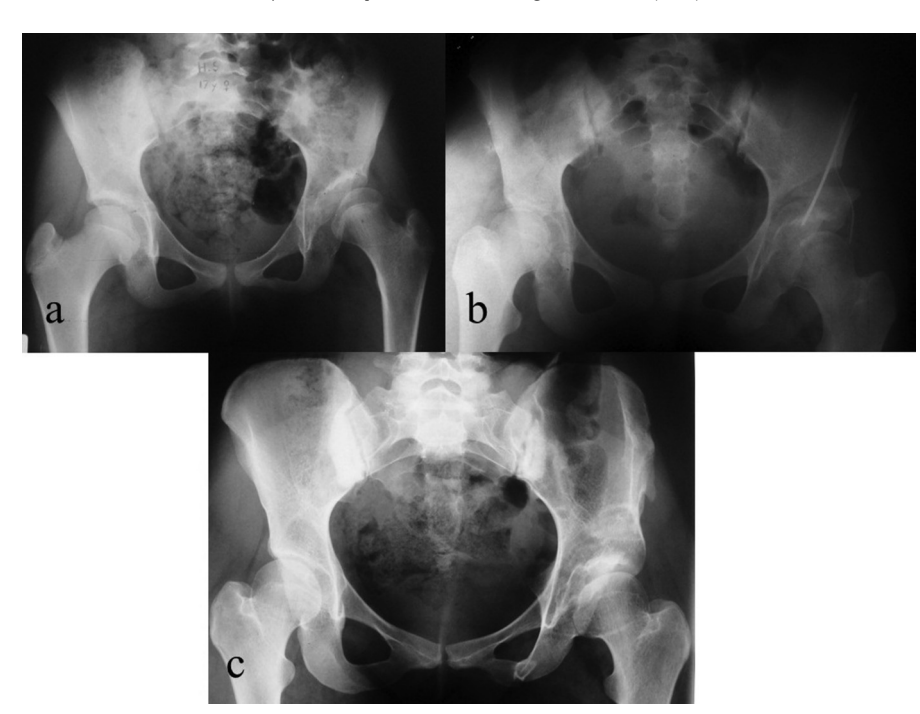
Fig. 3. Anteroposterior pelvic radiograph of a female with left acetabular dysplasia. a) Preoperative radiograph: the patient was 17 years old at the time of the operation. b) Early postoperative radiograph: the cranial acetabulum has retroverted (crossover at the cranial part of the acetabulum) postoperatively. c) Last follow-up radiographs: after 15.7 years of follow-up, there is no progression to osteoarthritis.